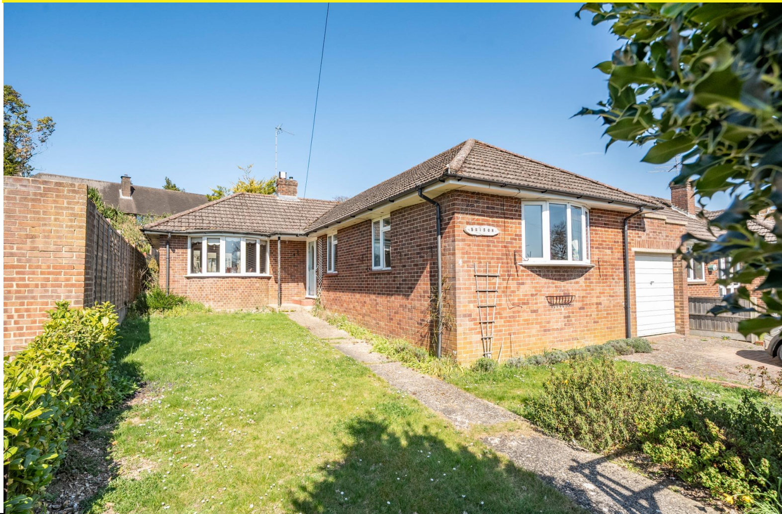
Mead Close, Andover Guide Price £450,000 Freehold