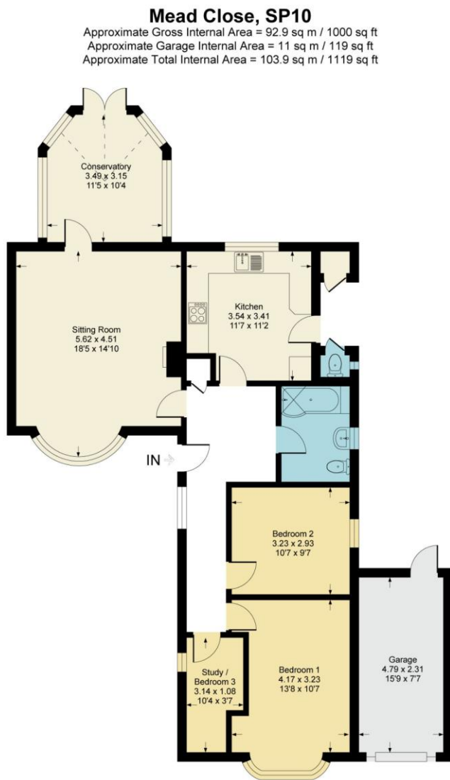
Ground Floor This floor plan is for representation purposes only as defined by the RICS code of Measuring Practice (and IPMS where requested) and should be used as such by any prospective purchaser. Whilst every attempt has been made to ensure the accuracy contained here, the measurement of doors, windows and rooms is approximate and no responsibility is taken for any error, omission or mis-statement. Specifically no guarantee is given on the total area of the property if quoted on the plan. Any figure provided is for guidance only and should not be used for valuation purposes. Produced for Austin Hawk Ltd AH austinhawk ESTATE AGENTS