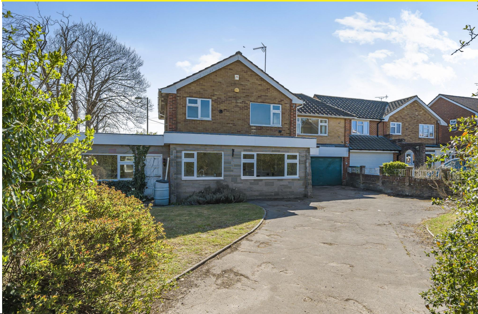
Thistledown Close, Andover Guide Price £450,000 Freehold