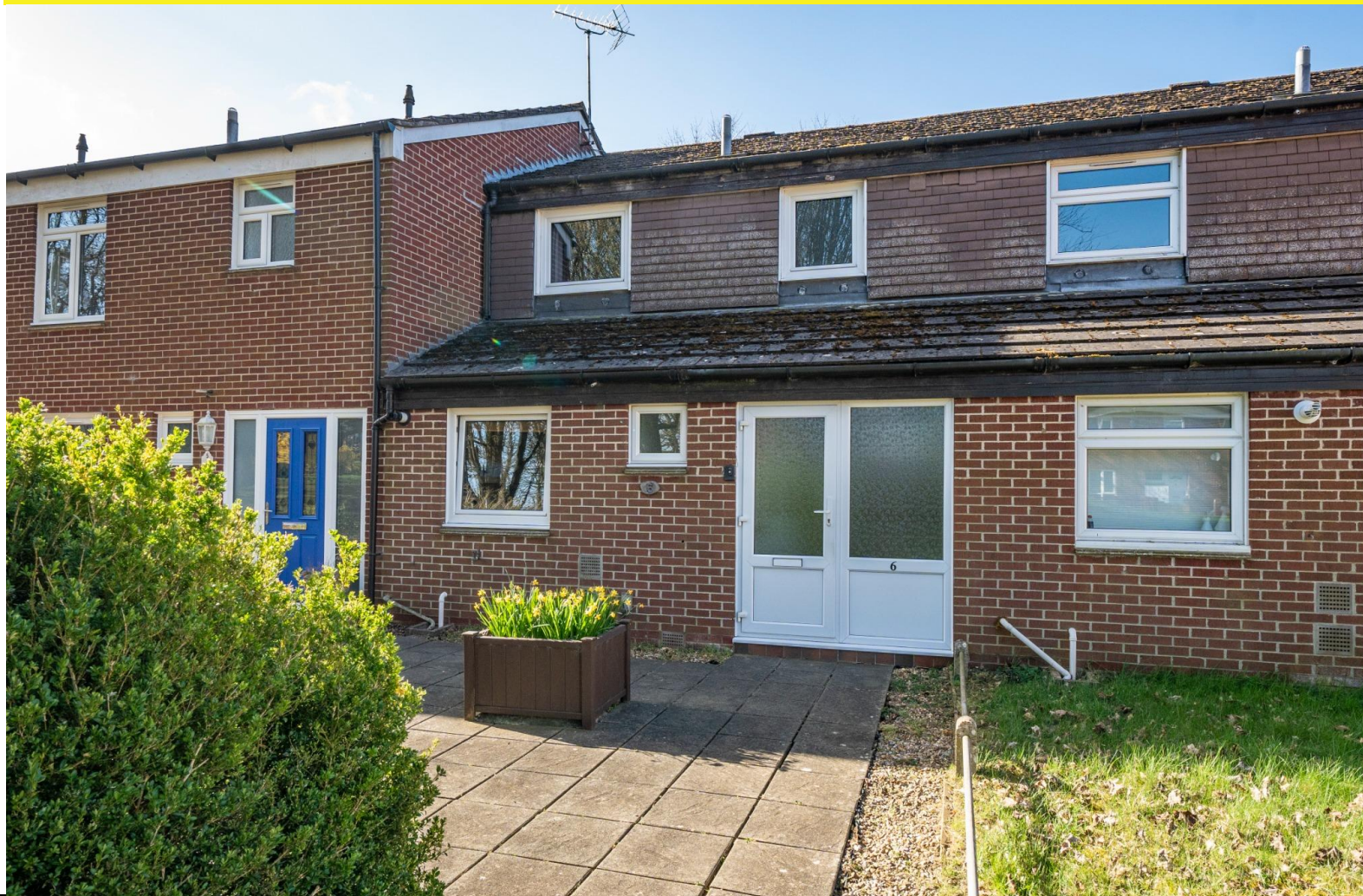
Munnings Court, Andover Guide Price £264,950 Freehold