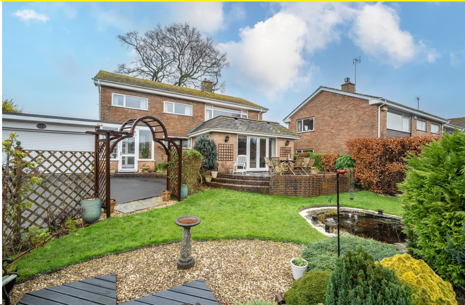
The Dell, Vernham Dean