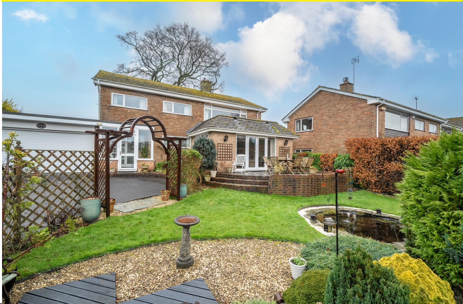
The Dell, Vernham Dean