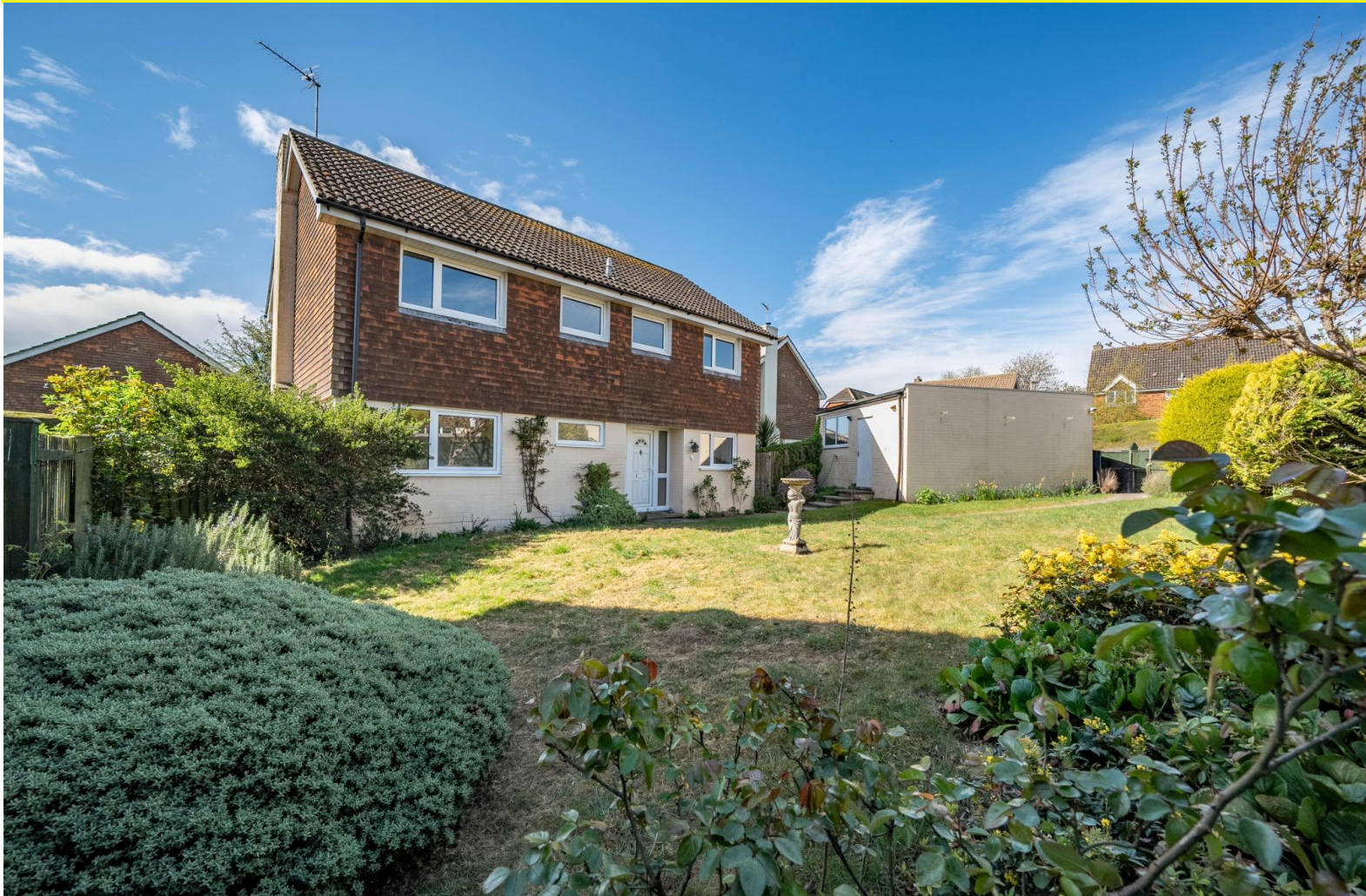
Bradwell Close, Charlton OIRO £500,000 Freehold