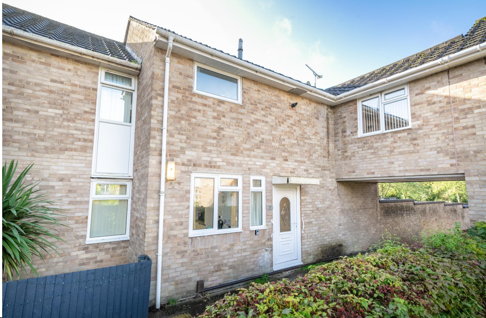
Hutton Square, Andover Guide Price £250,000 Freehold