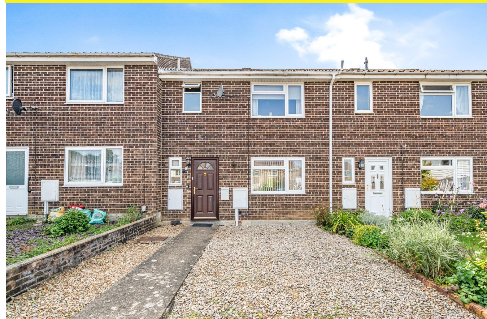
Springfield Close, Andover