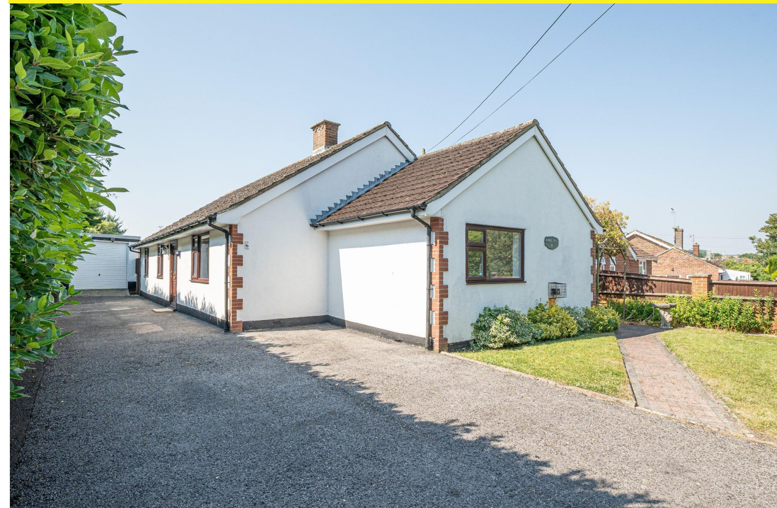
Deweys Lane, Ludgershall