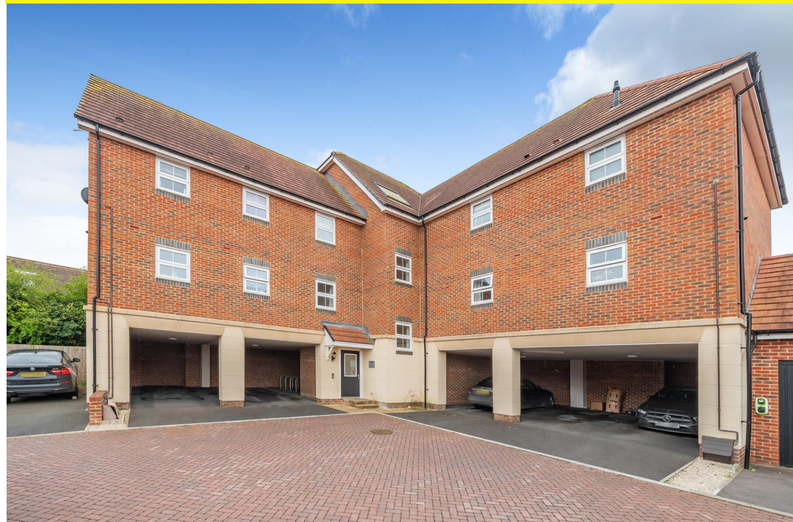
Marchmont Close, Picket Piece