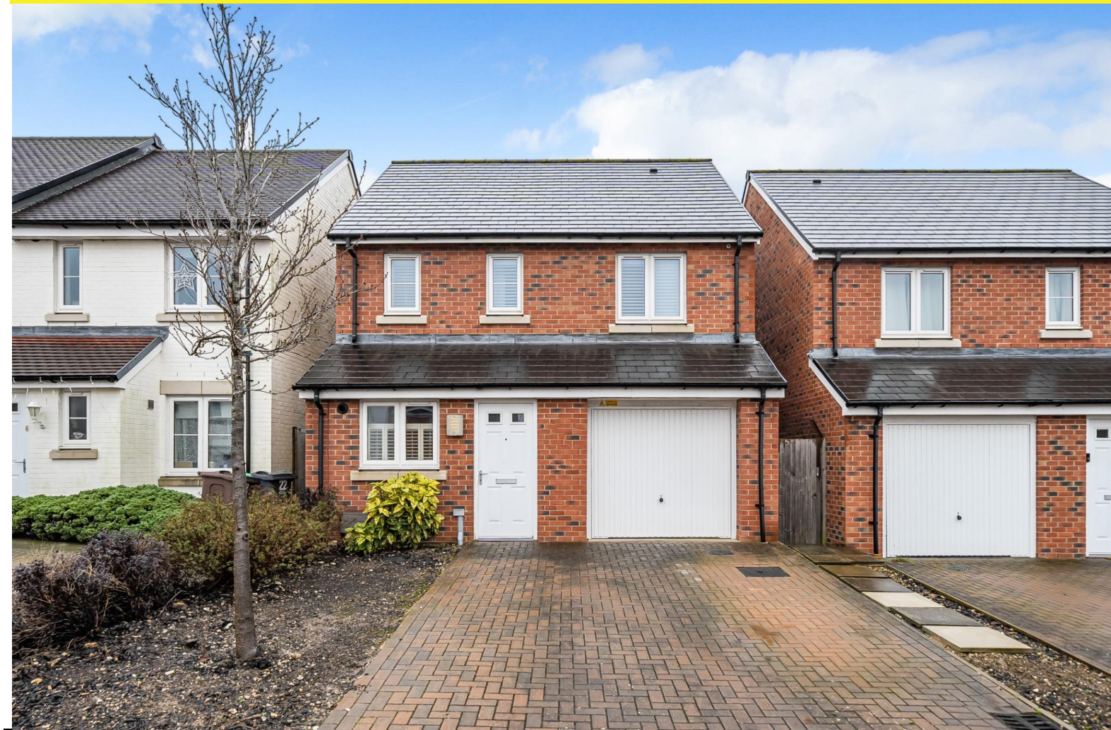
Bridle Close, Andover