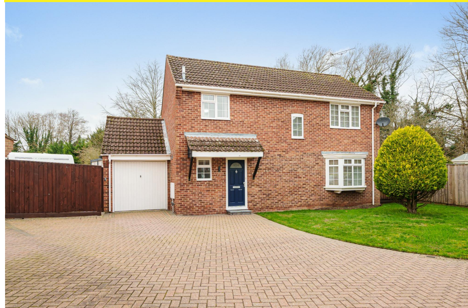
Sainsbury Close, Andover