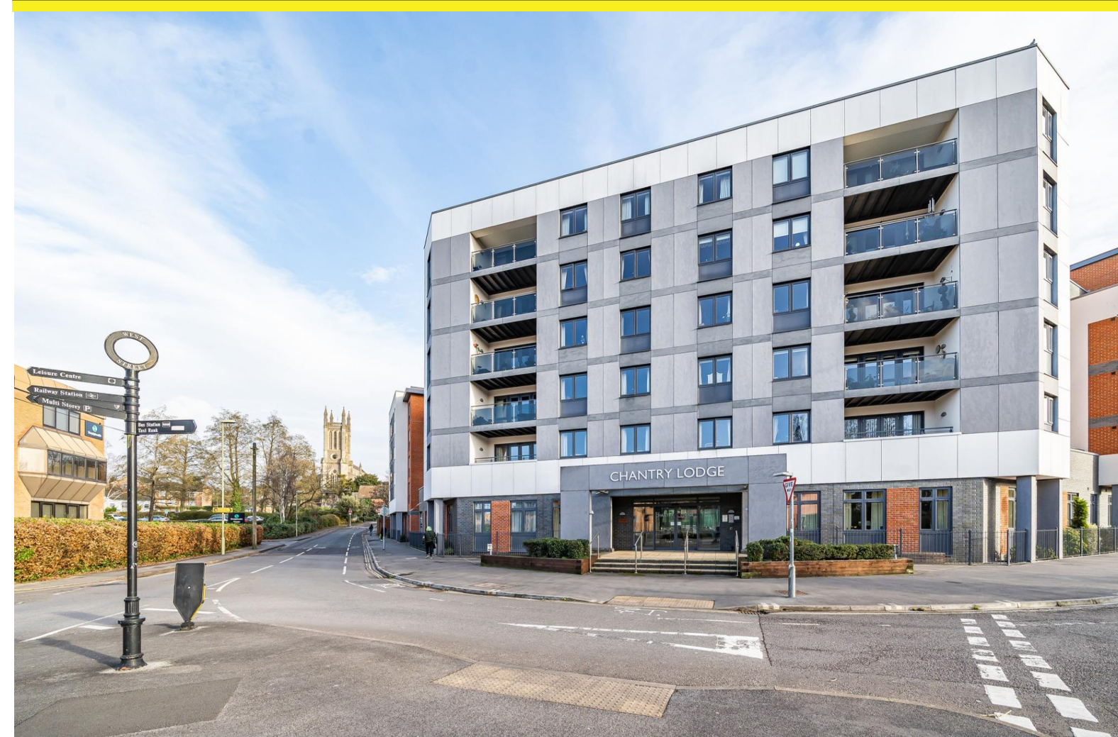
Chantry Lodge, Andover