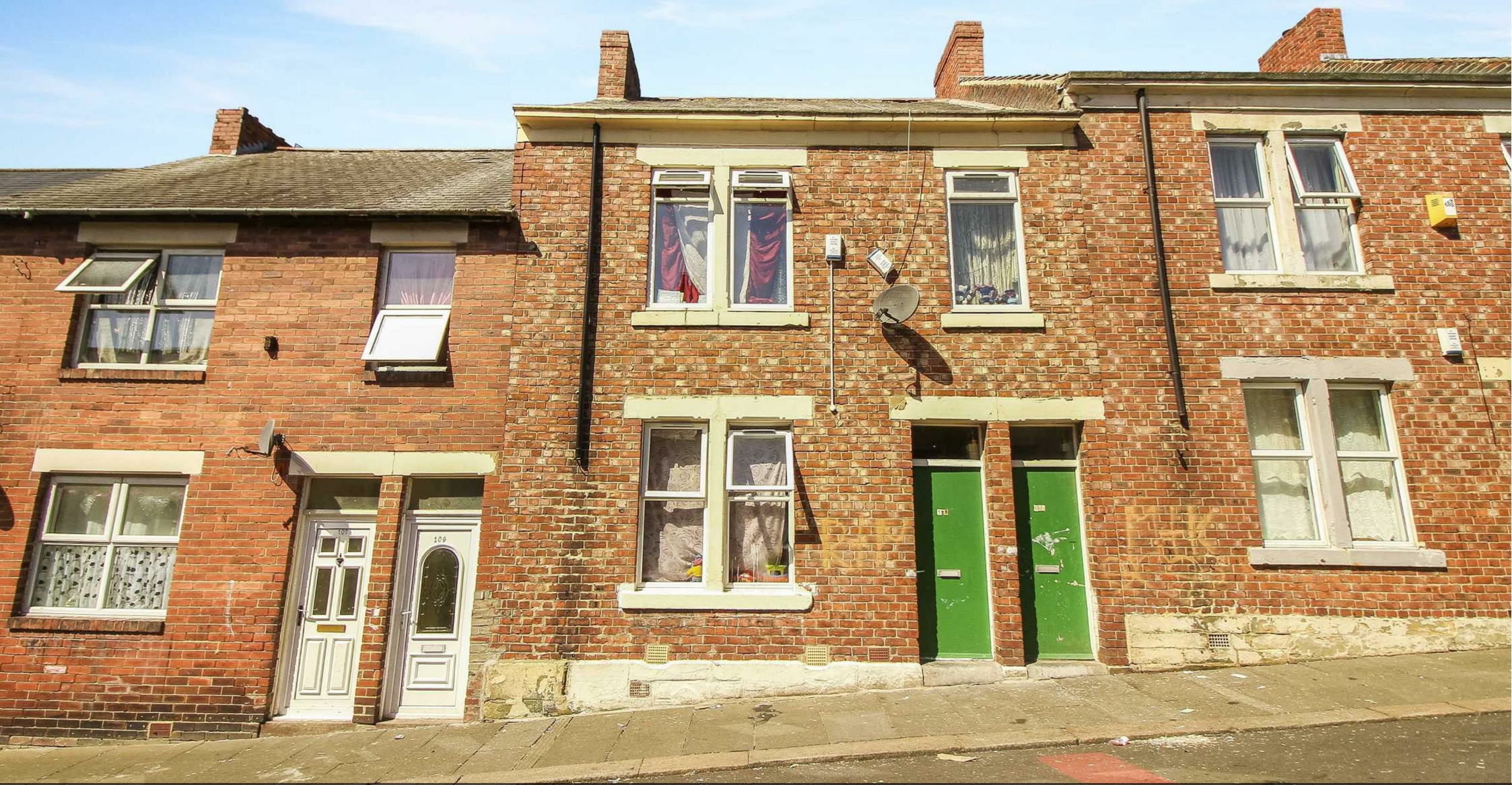
📍 Canning Street, Benwell NE4 8UH