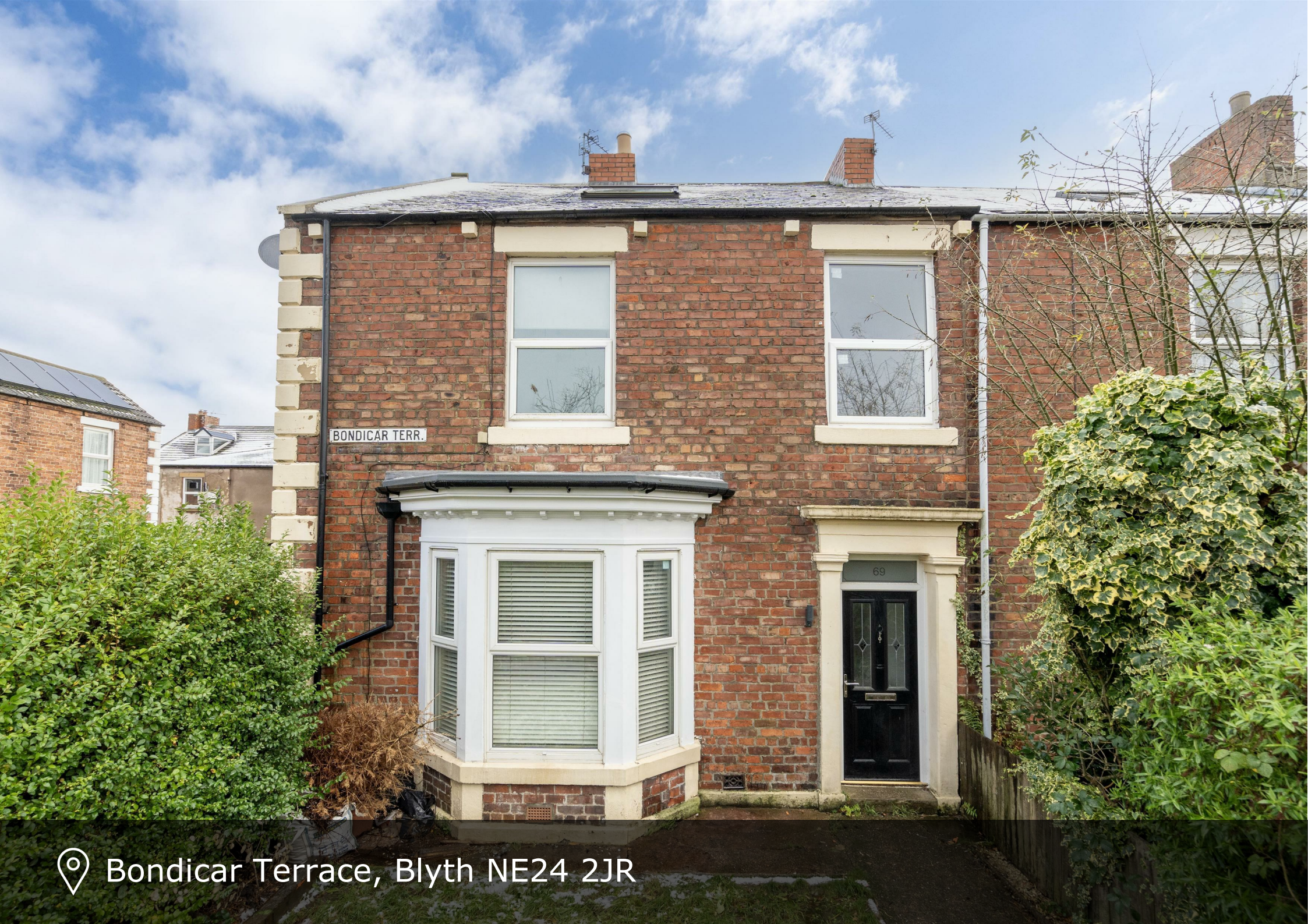
📍 Bondicar Terrace, Blyth NE24 2JR