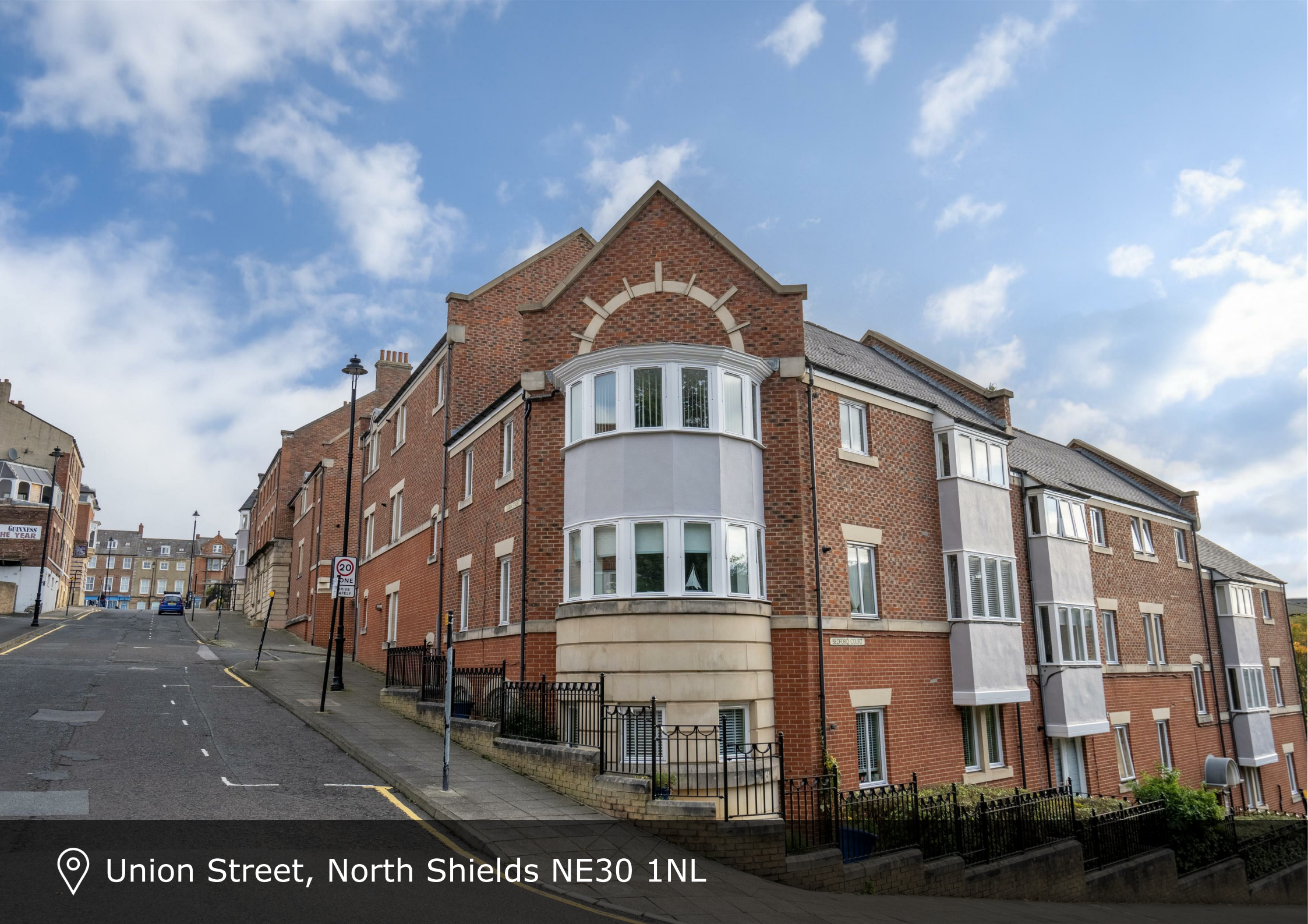
📍 Union Street, North Shields NE30 1NL