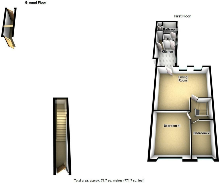
Total area: approx. 71.7 sq. metres (771.7 sq. feet)