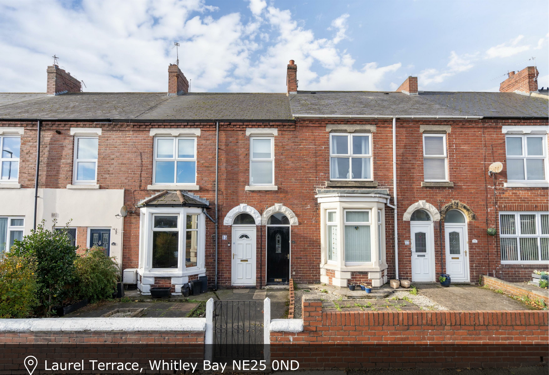
📍 Laurel Terrace, Whitley Bay NE25 0ND