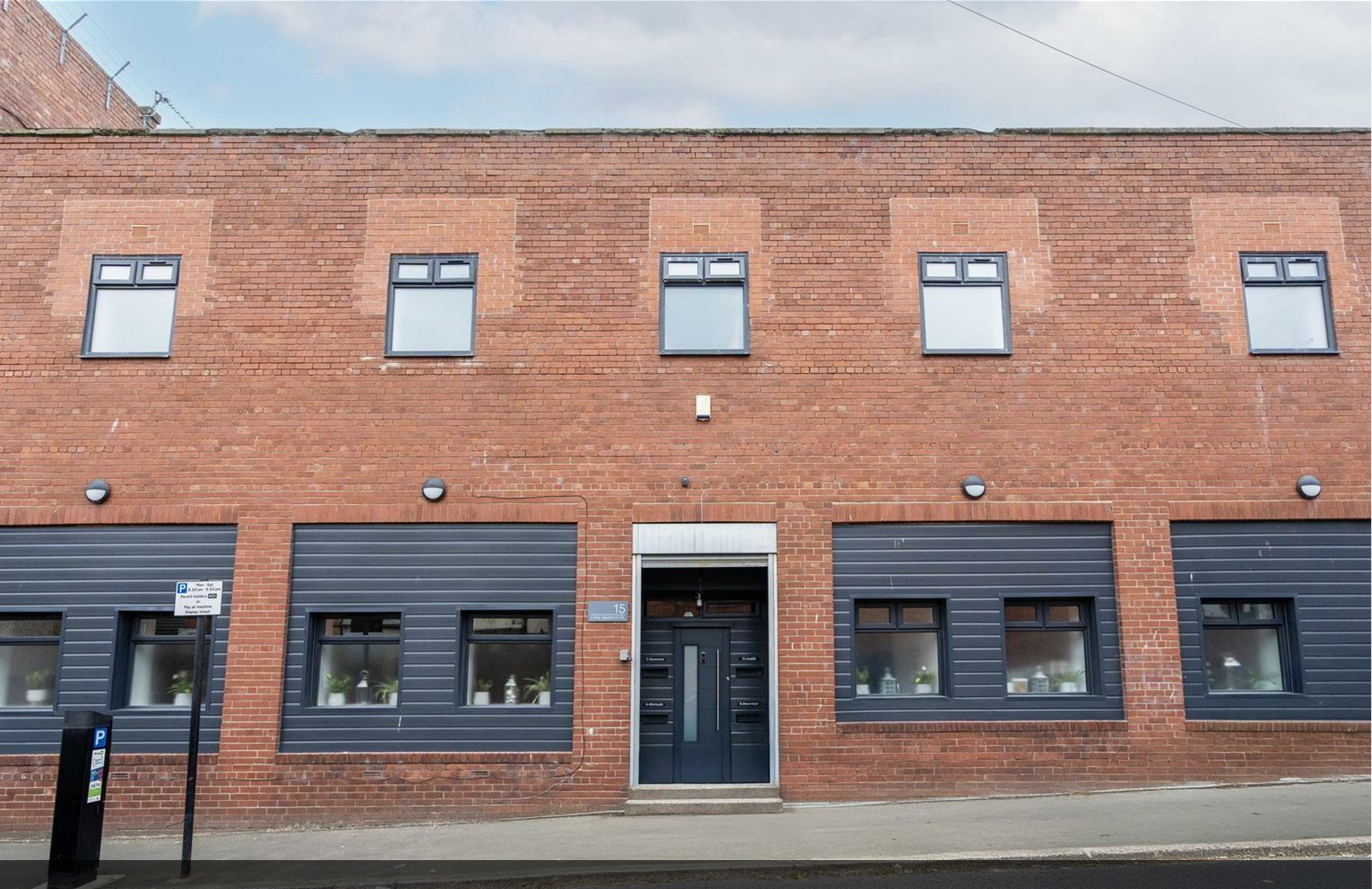
📍 Little Bedford Street, North Shields NE29 6NW