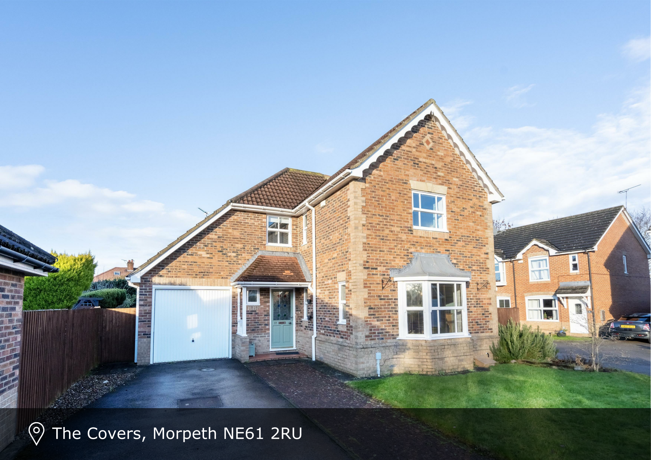
📍 The Covers, Morpeth NE61 2RU