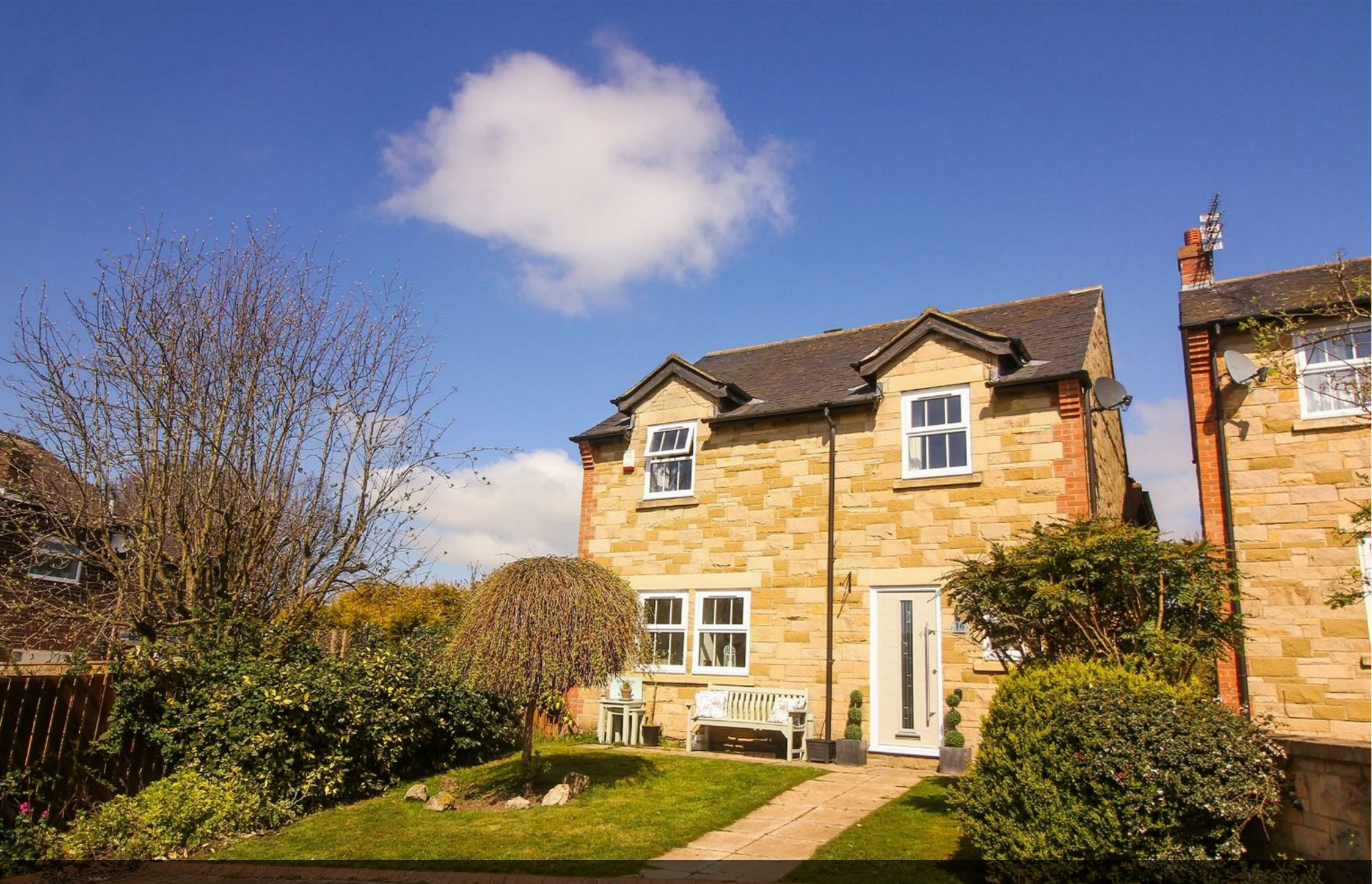
📍 Village Farm, Newcastle Upon Tyne NE15 8JW