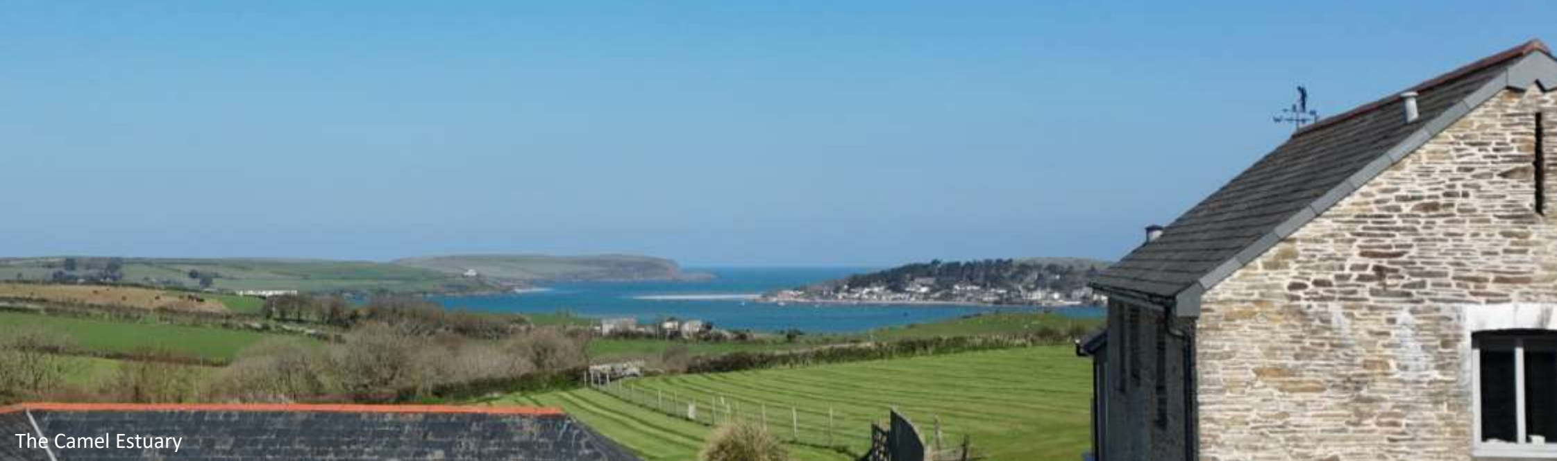
The Camel Estuary