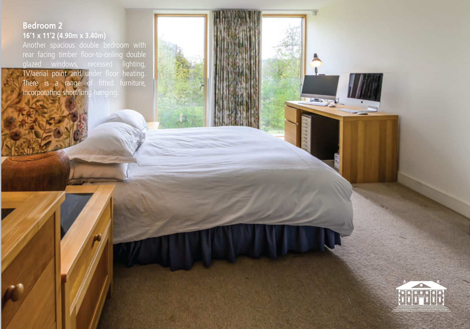
Bedroom 2 16'1 x 11'2 (4.90m x 3.40m)

Another spacious double bedroom with rear facing timber floor-to-ceiling double glazed windows, recessed lighting, TV/aerial point and under floor heating. There is a range of fitted furniture, incorporating short/long hanging.