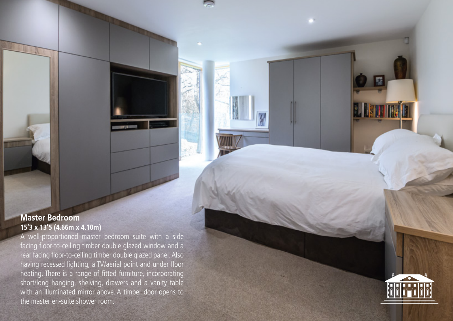
Master Bedroom 15'3 x 13'5 (4.66m x 4.10m)

A well-proportioned master bedroom suite with a side facing floor-to-ceiling timber double glazed window and a rear facing floor-to-ceiling timber double glazed panel. Also having recessed lighting, a TV/aerial point and under floor heating. There is a range of fitted furniture, incorporating short/long hanging, shelving, drawers and a vanity table with an illuminated mirror above. A timber door opens to the master en-suite shower room.