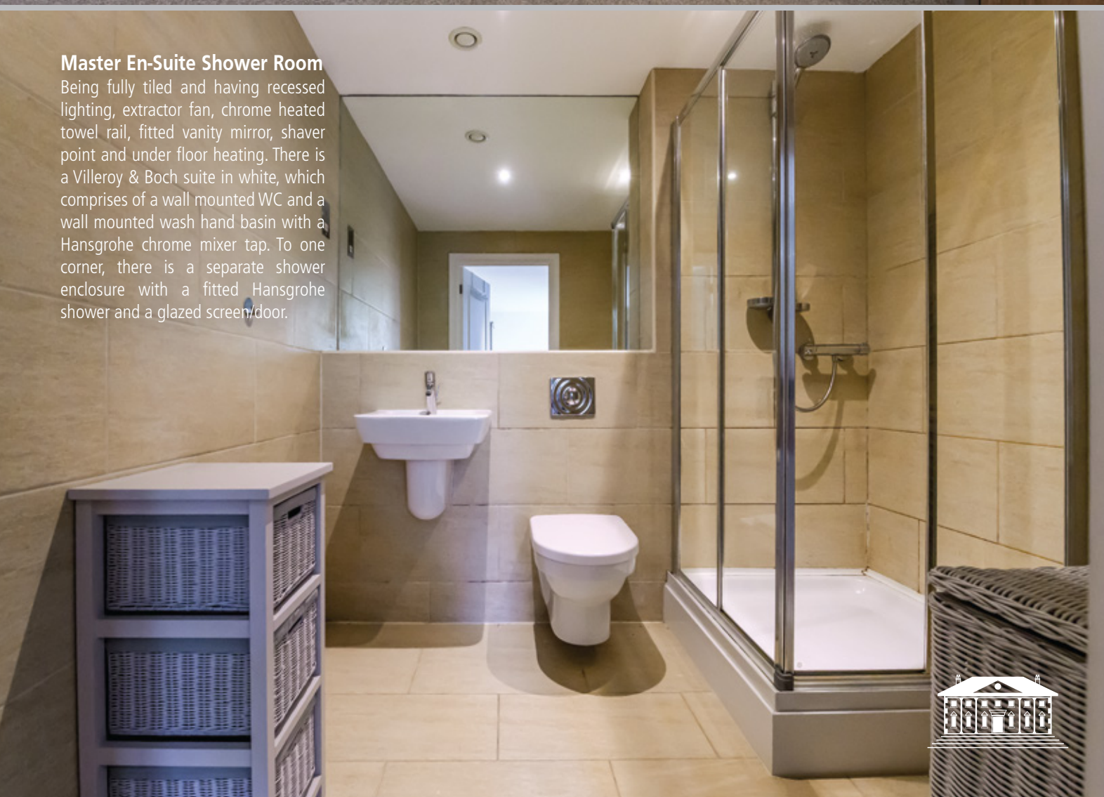
Master En-Suite Shower Room

Being fully tiled and having recessed lighting, extractor fan, chrome heated towel rail, fitted vanity mirror, shaver point and under floor heating. There is a Villeroy & Boch suite in white, which comprises of a wall mounted WC and a wall mounted wash hand basin with a Hansgrohe chrome mixer tap. To one corner, there is a separate shower enclosure with a fitted Hansgrohe shower and a glazed screen/door.