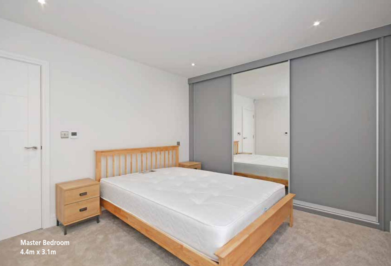
Master Bedroom 4.4m x 3.1m