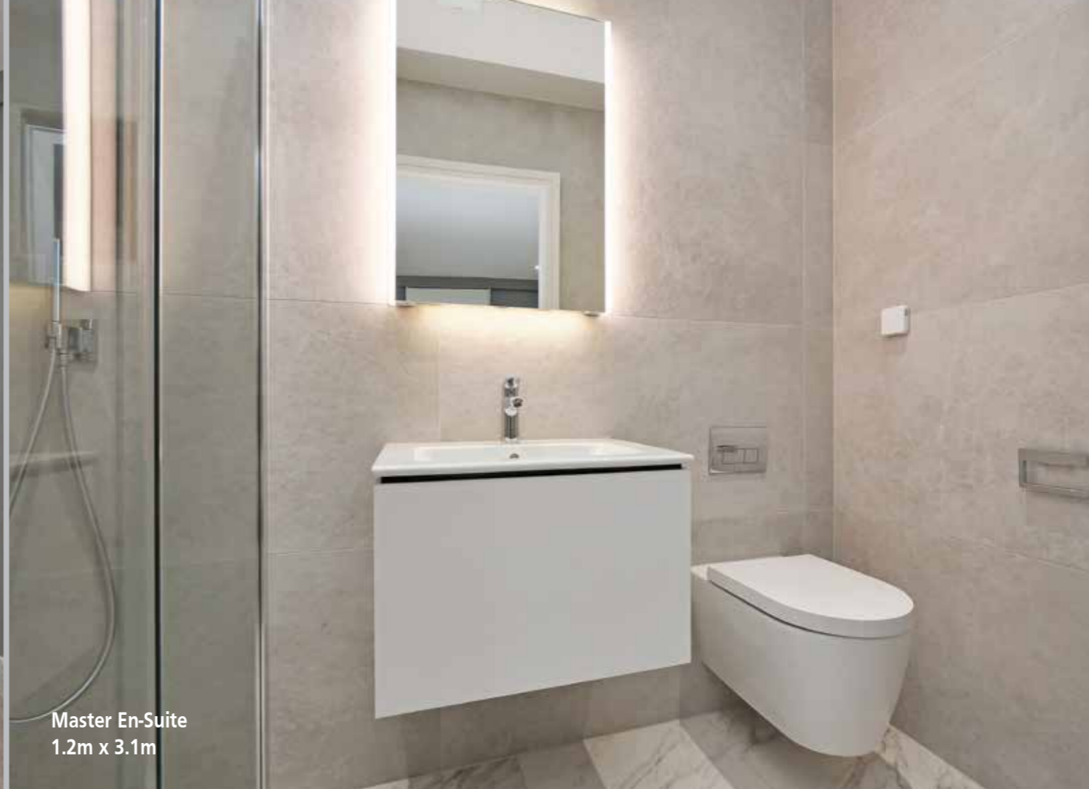
Master En-Suite 1.2m x 3.1m