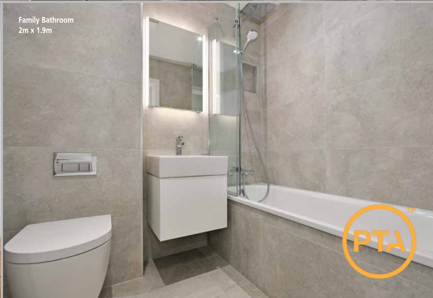
Family Bathroom 2m x 1.9m