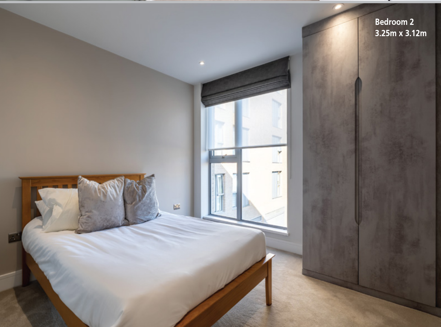
Bedroom 2 3.25m x 3.12m