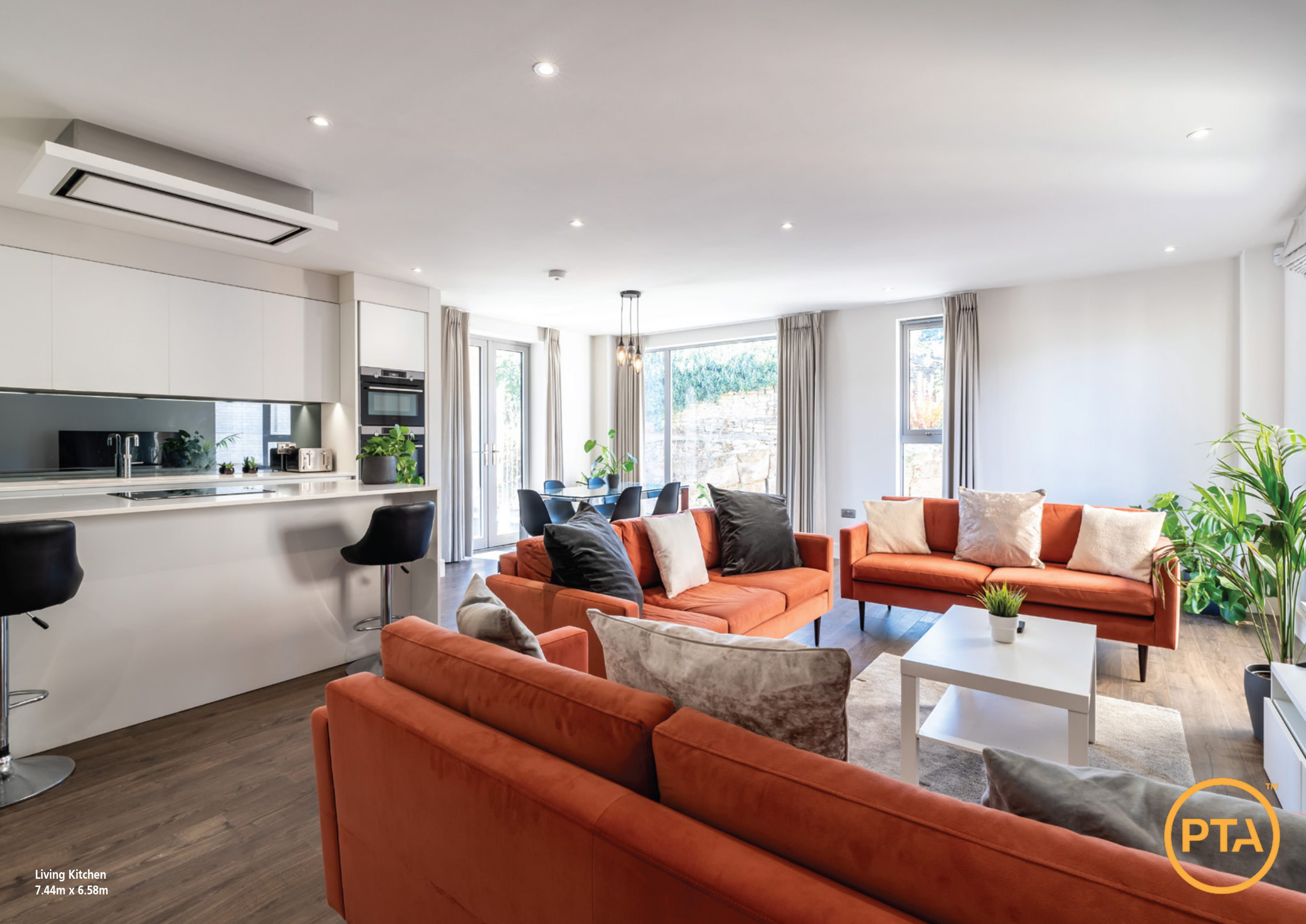
Living Kitchen 7.44m x 6.58m