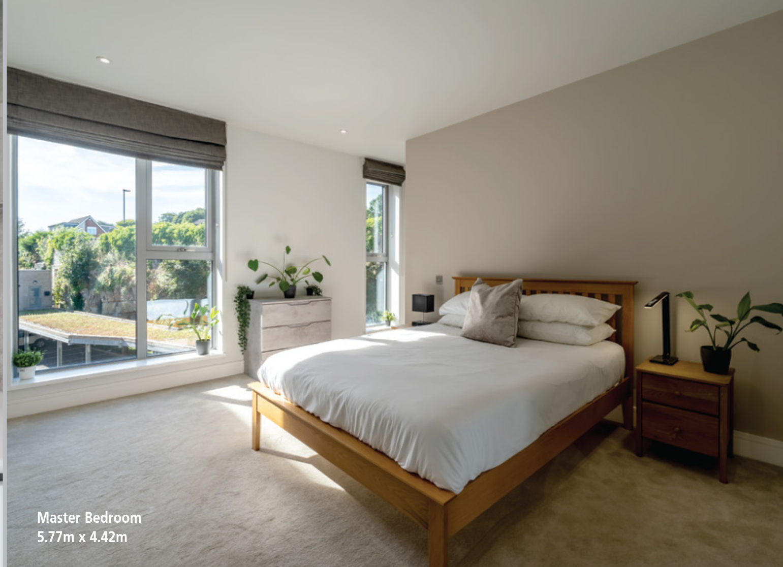
Master Bedroom 5.77m x 4.42m