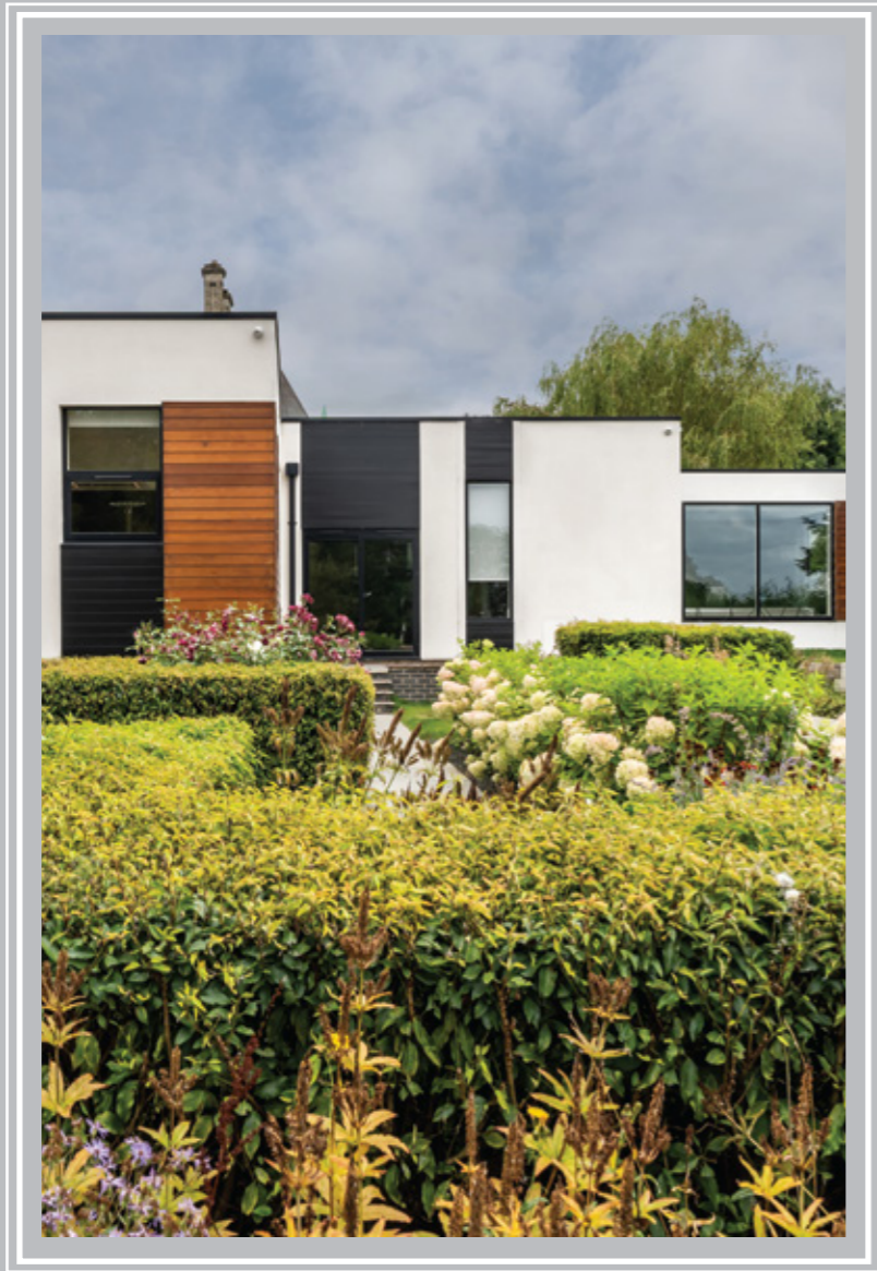
The Maltings 5 Wales Court, Manor Road