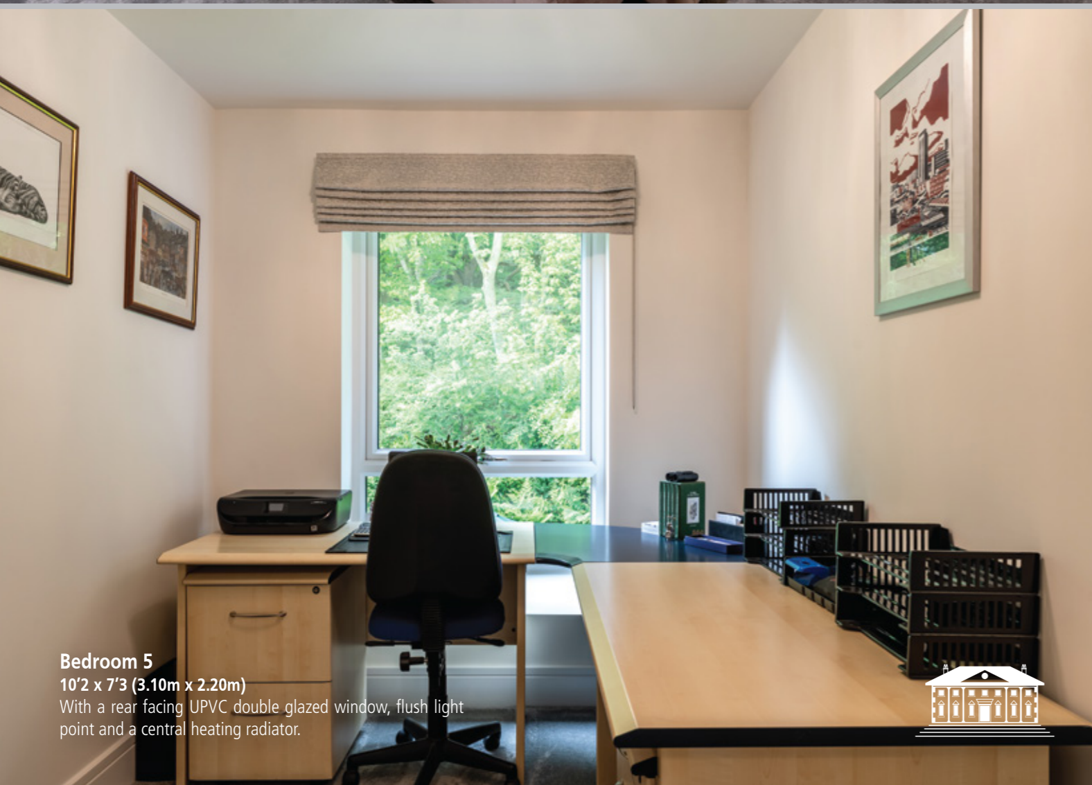
Bedroom 5 10'2 x 7'3 (3.10m x 2.20m) With a rear facing UPVC double glazed window, flush light point and a central heating radiator.