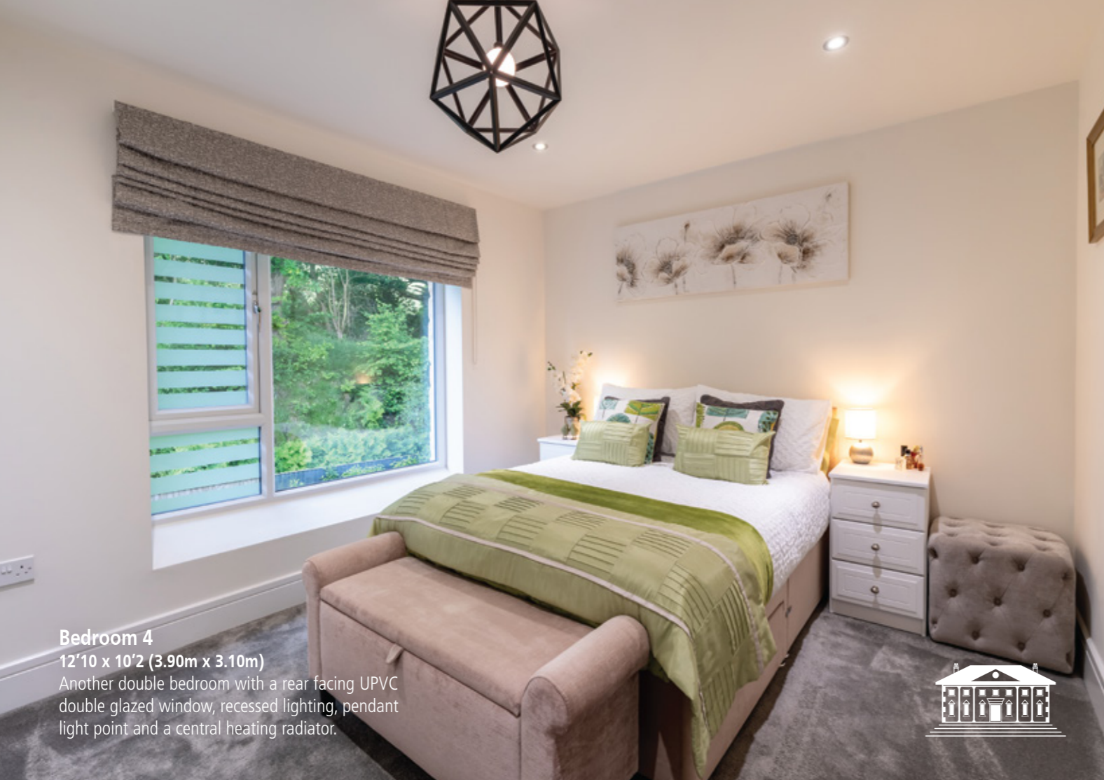
Bedroom 4 12'10 x 10'2 (3.90m x 3.10m) Another double bedroom with a rear facing UPVC double glazed window, recessed lighting, pendant light point and a central heating radiator.