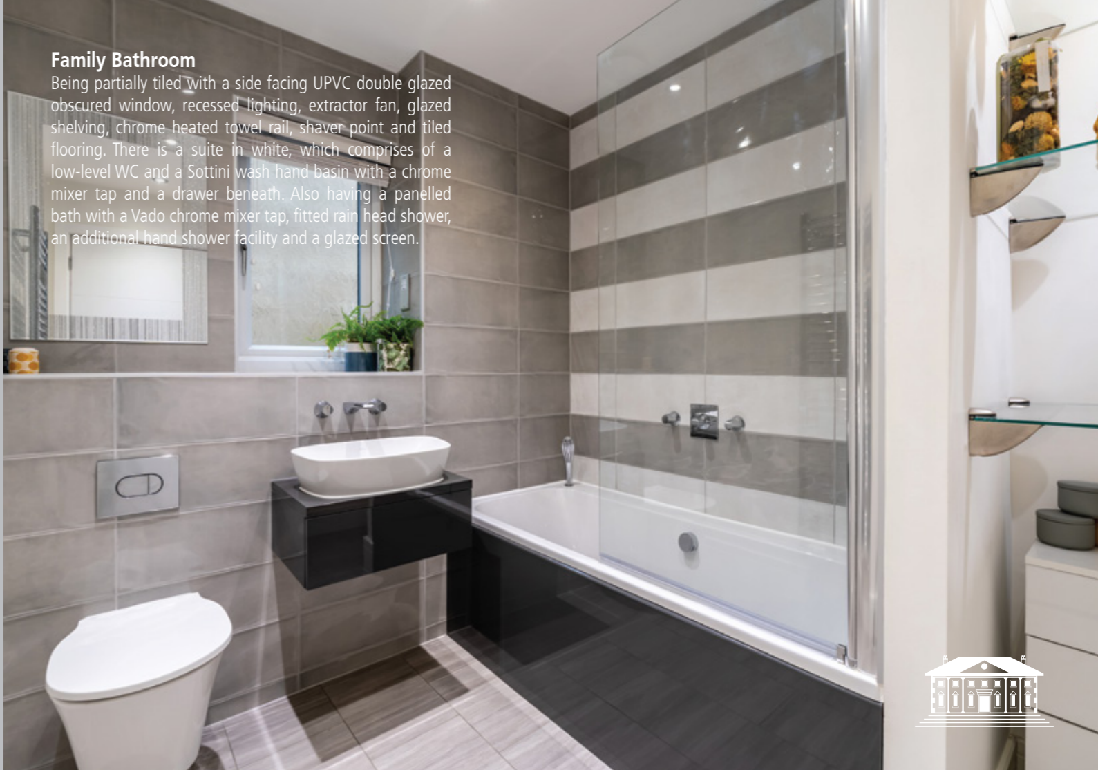
Family Bathroom Being partially tiled with a side facing UPVC double glazed obscured window, recessed lighting, extractor fan, glazed shelving, chrome heated towel rail, shaver point and tiled flooring. There is a suite in white, which comprises of a low-level WC and a Sottini wash hand basin with a chrome mixer tap and a drawer beneath. Also having a panelled bath with a Vado chrome mixer tap, fitted rain head shower, an additional hand shower facility and a glazed screen.