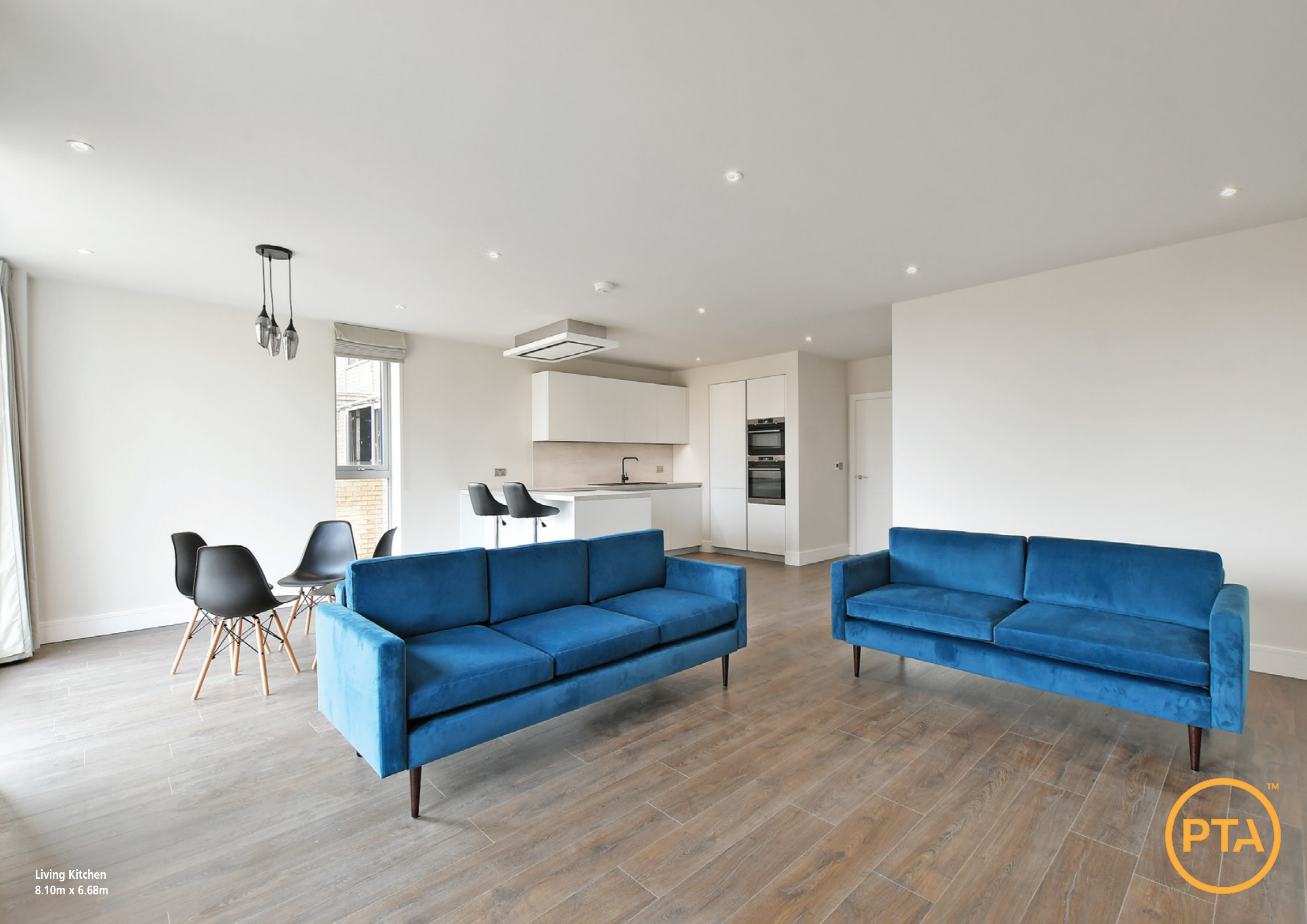
Living Kitchen 8.10m x 6.68m