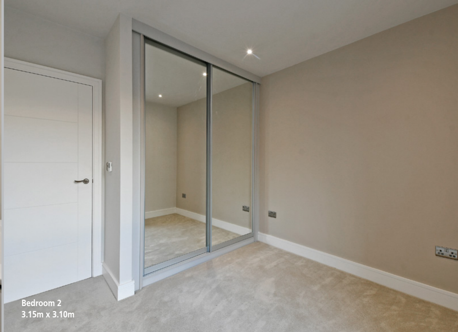
Bedroom 2 3.15m x 3.10m