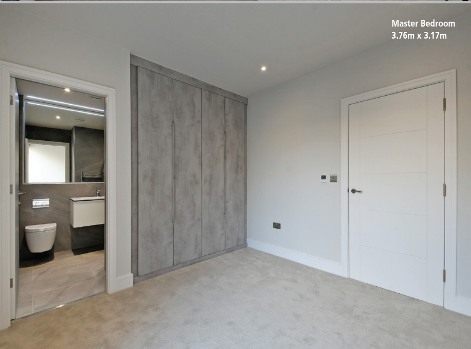
Master Bedroom 3.76m x 3.17m