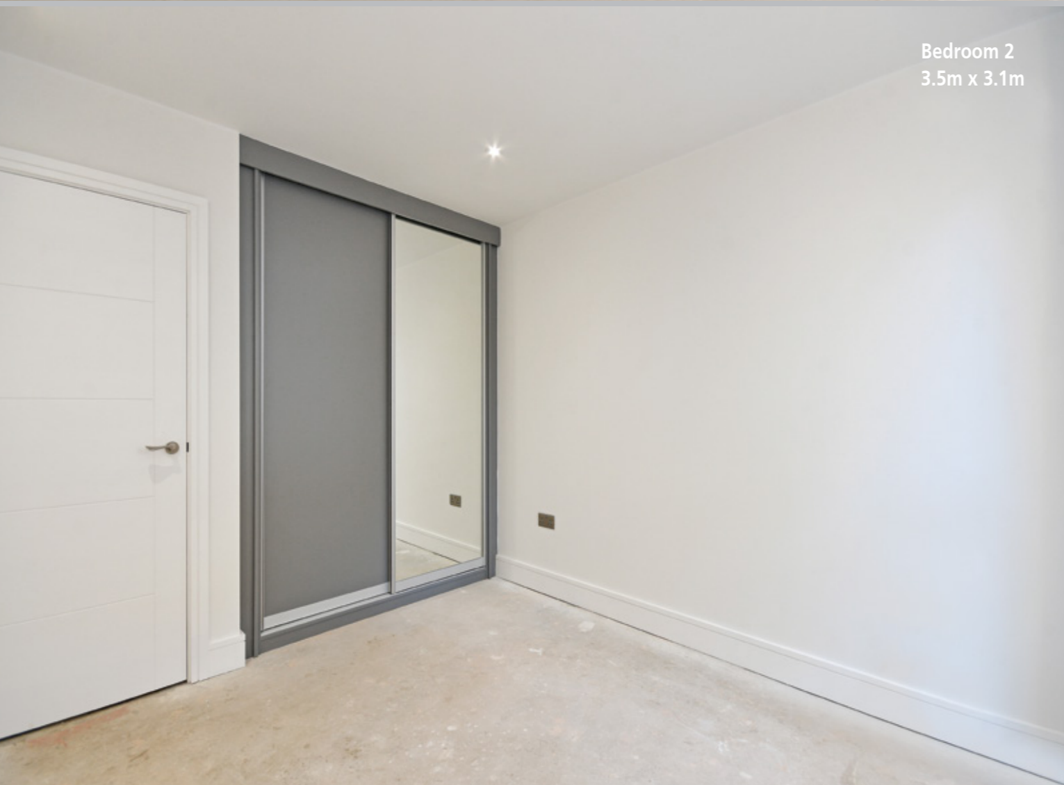
Bedroom 2 3.5m x 3.1m