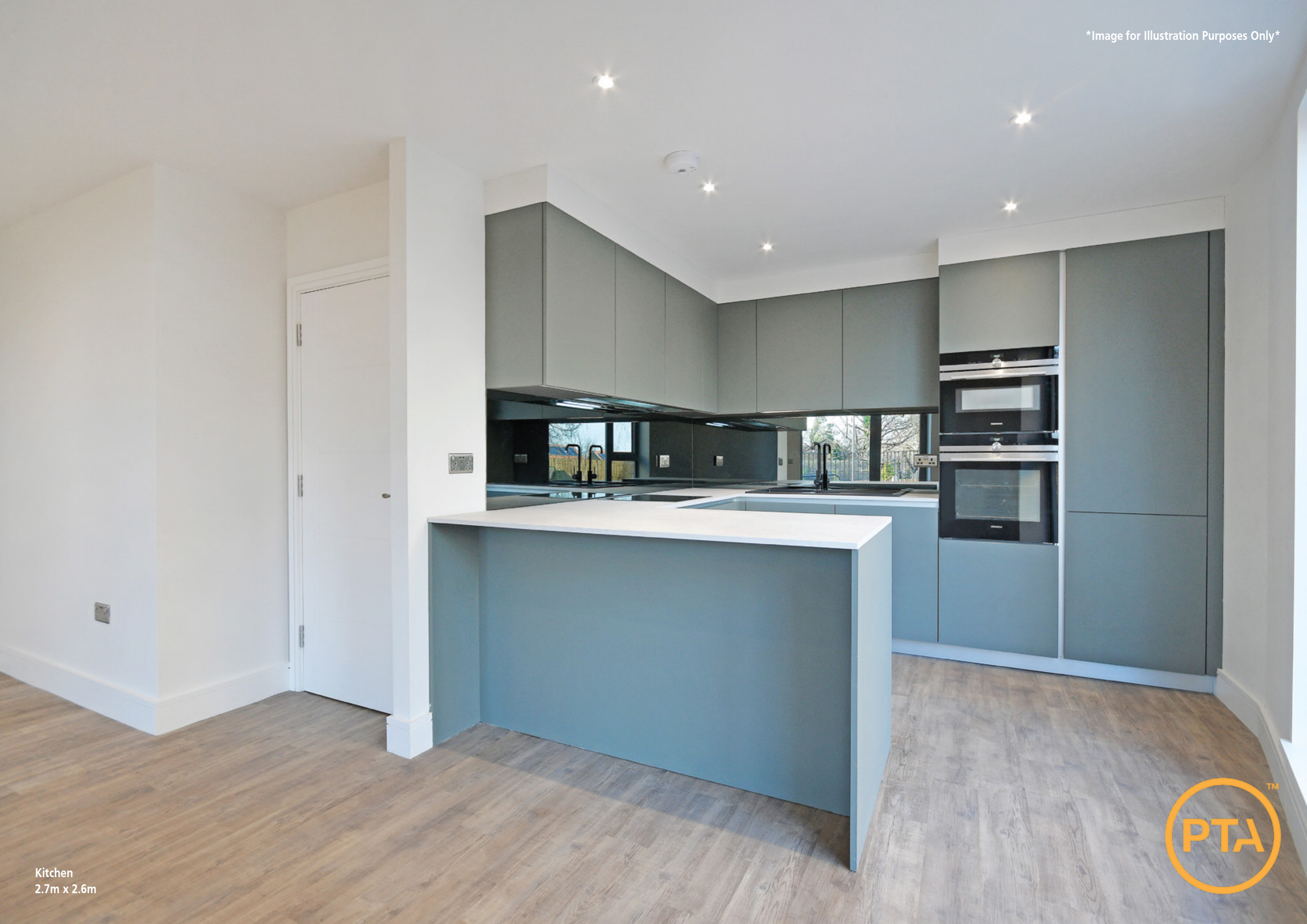
Kitchen 2.7m x 2.6m