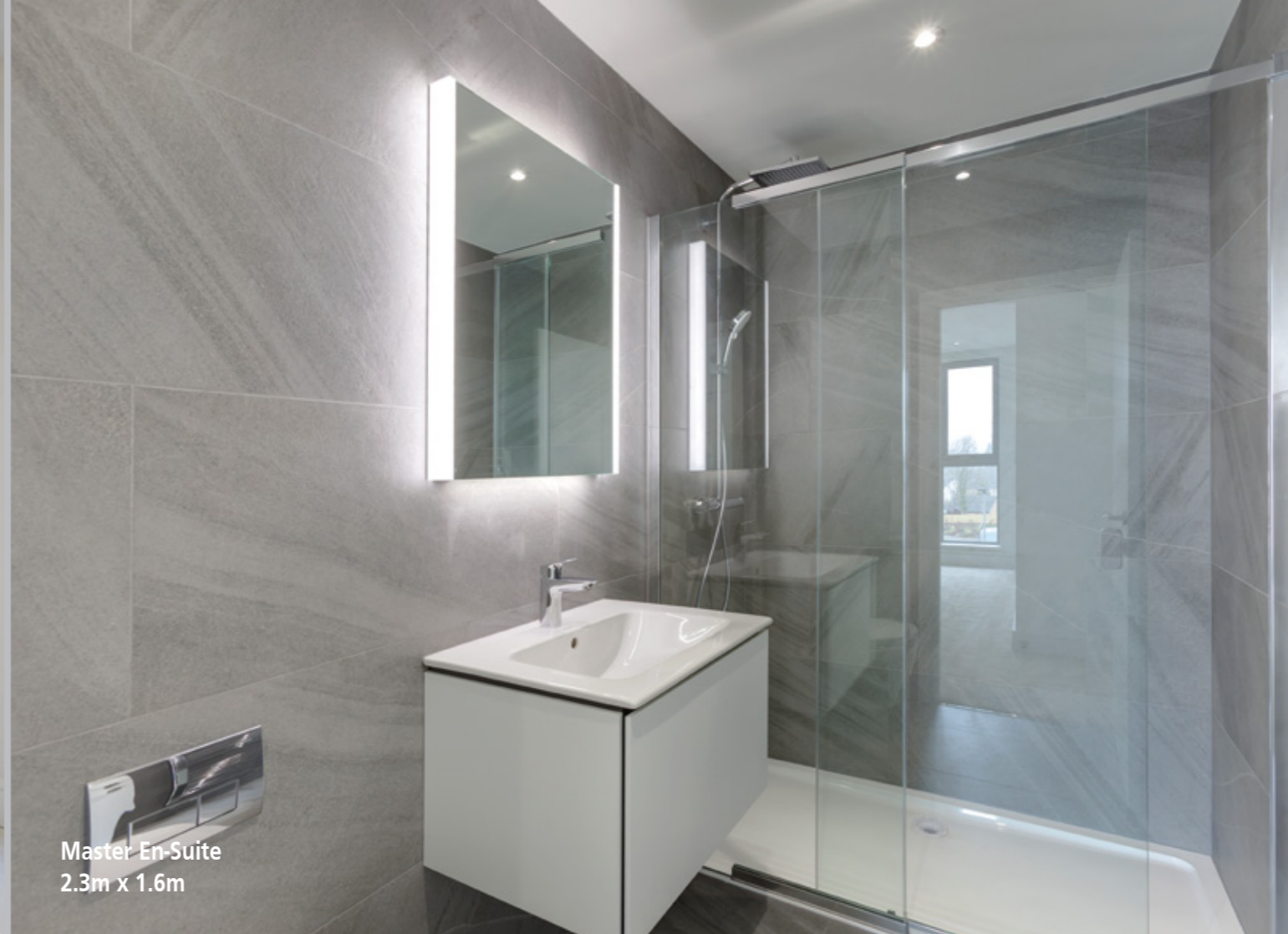
Master En-Suite 2.3m x 1.6m