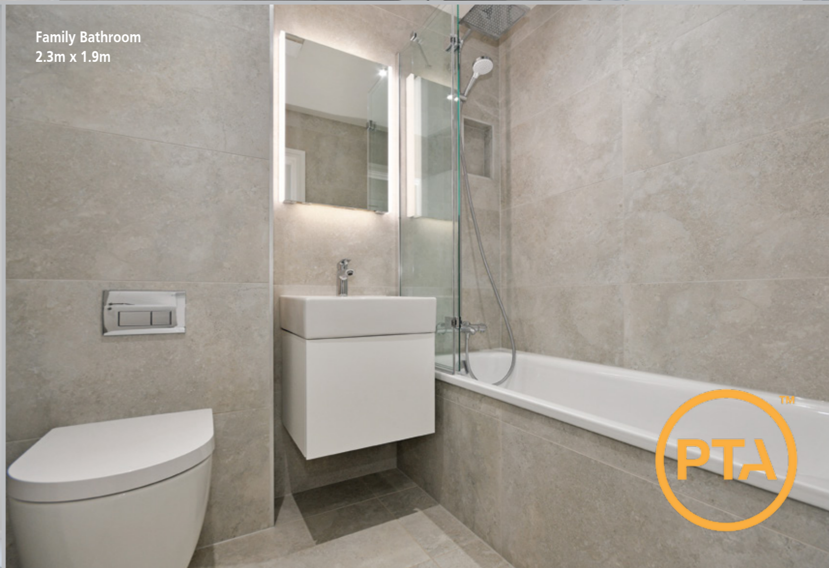
Family Bathroom 2.3m x 1.9m