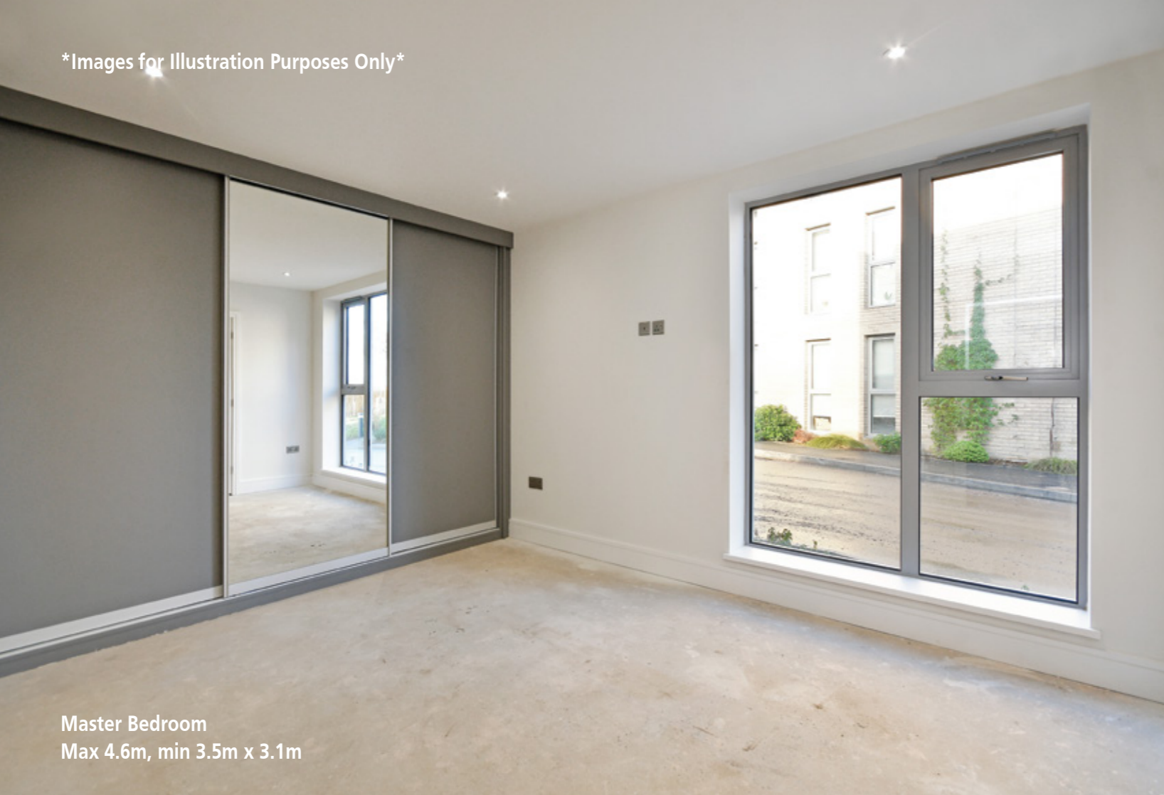
Master Bedroom Max 4.6m, min 3.5m x 3.1m