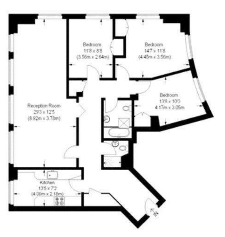
Fourth Floor = 1152 sq ft / 107 sq m

IMPORTANT: We would inform prospective purchasers that these sales particulars have been prepared as a general guide only. A detailed survey has not been carried out, nor the services, appliances and fittings tested. Room sizes should not be relied upon for furnishing purposes and are approximate. If floor plans are included, they are for guidance only and illustration purposes only and may not be to scale. If there are any important matters likely to affect your decision to buy, please contact us before viewing the property.