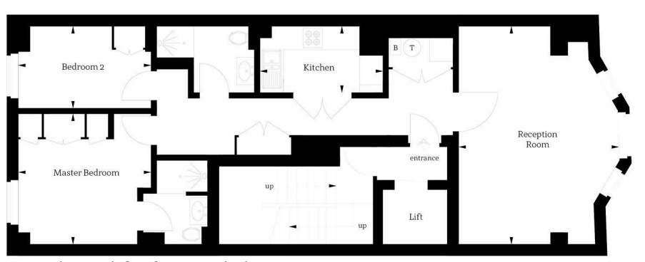
Apartment 2 - Second Floor

Service Charge: £7,847.64 per annum Council Tax Westminster Band G