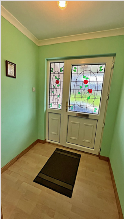
Porch - 1.72m x 1.63m