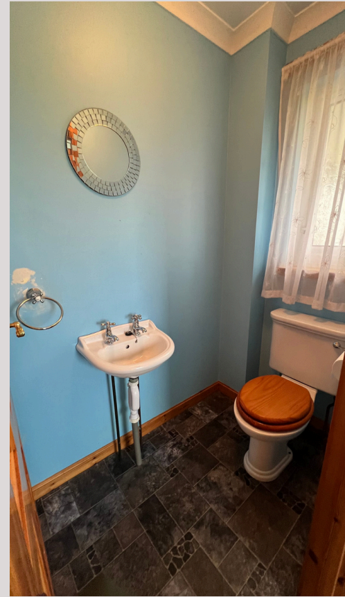
W/C - 1.01m x 1.52m