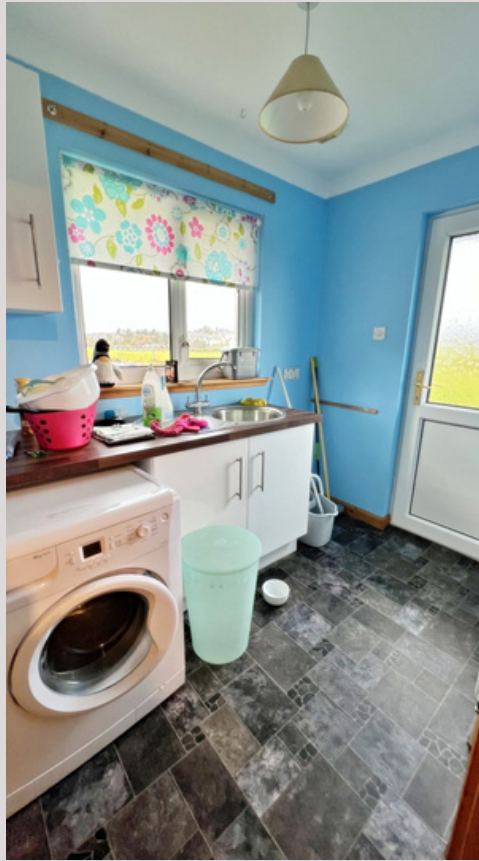
Utility Room - 1.69m x 2.39m