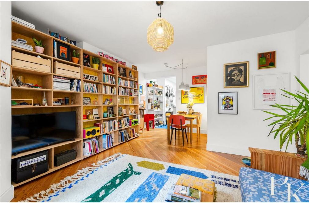
Goldsmid Road, Hove Approximately 77.7 sqm (837 sqft)