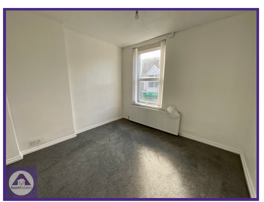
High Street, Blaina