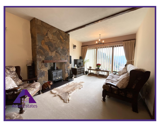
Penrhiwgarreg Houses, Abertillery, NP13 1BH