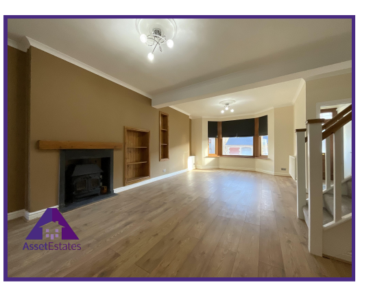
Gwern Berthi Road, Cwmtillery, Abertillery, NP13 1QZ