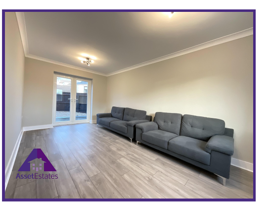
Glanhowy Street, Scwrfa, Tredegar, NP22 4AW