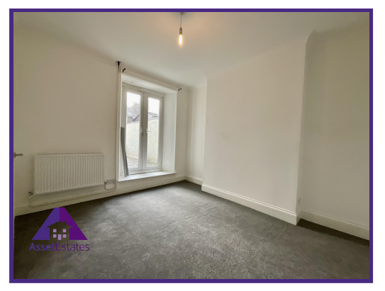
Libanus Road, Ebbw Vale, NP23 6EJ