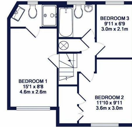
1ST FLOOR APPROX. FLOOR AREA 452 SQ.FT. (42.0 SQ.M.)

TOTAL APPROX. FLOOR AREA 1023 SQ.FT. (95.1 SQ.M.)