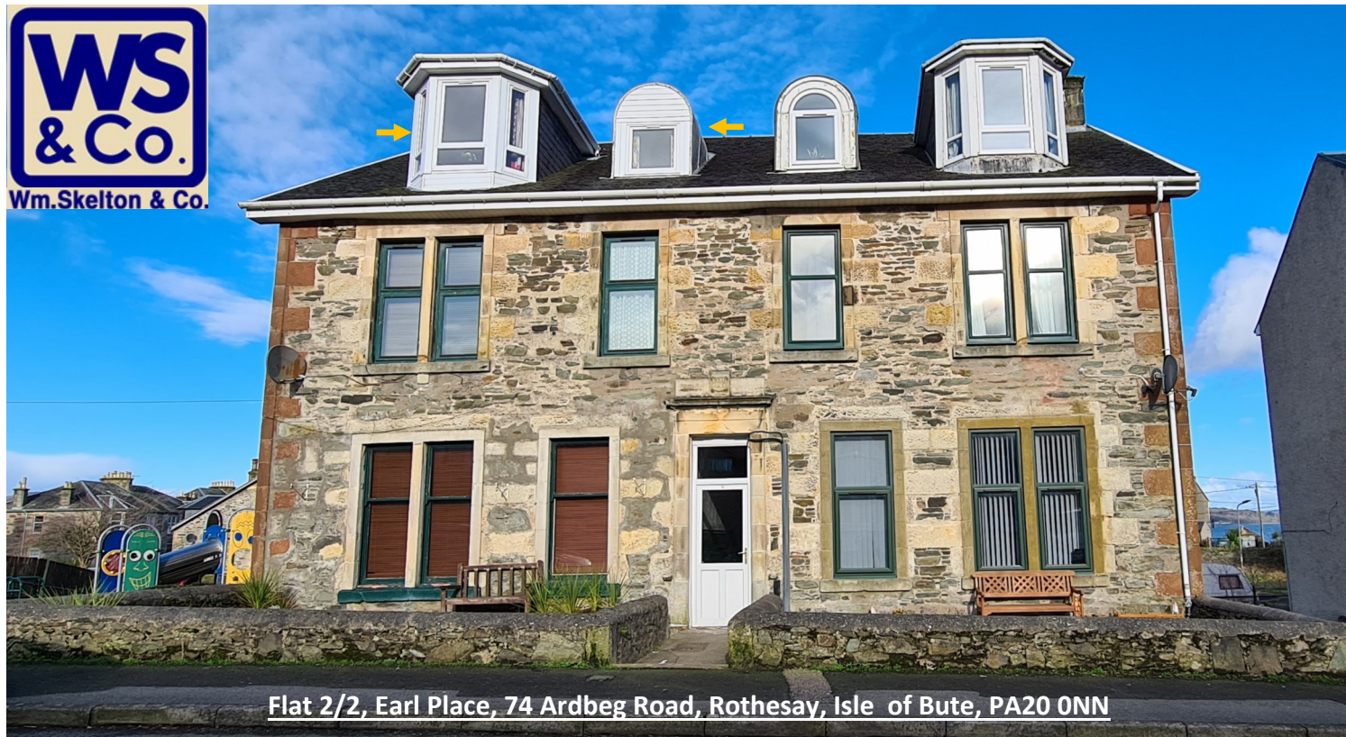
Flat 2/2, Earl Place, 74 Ardbeg Road, Rothesay, Isle of Bute, PA20 0NN