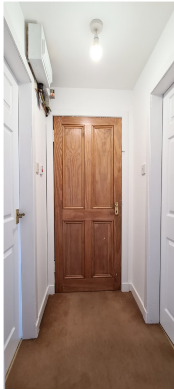
Hall - 1.31m x 0.97m

Pendant light. Smoke alarm. Electricity meter and switchboard. Carpet. White painted doors to all rooms.