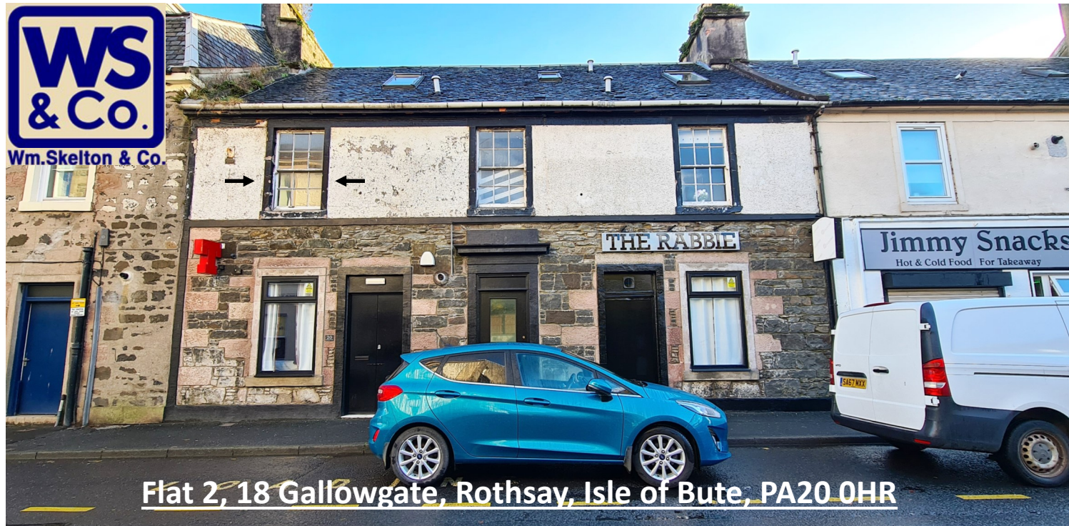
Flat 2, 18 Gallowgate, Rothesay, Isle of Bute, PA20 0HR