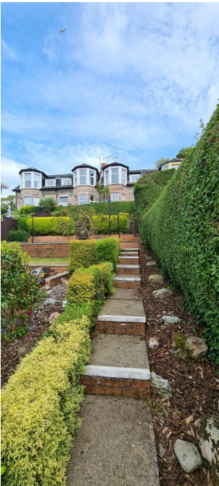
For Guidance Only - Not to Scale