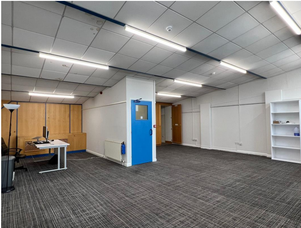
First floor office space