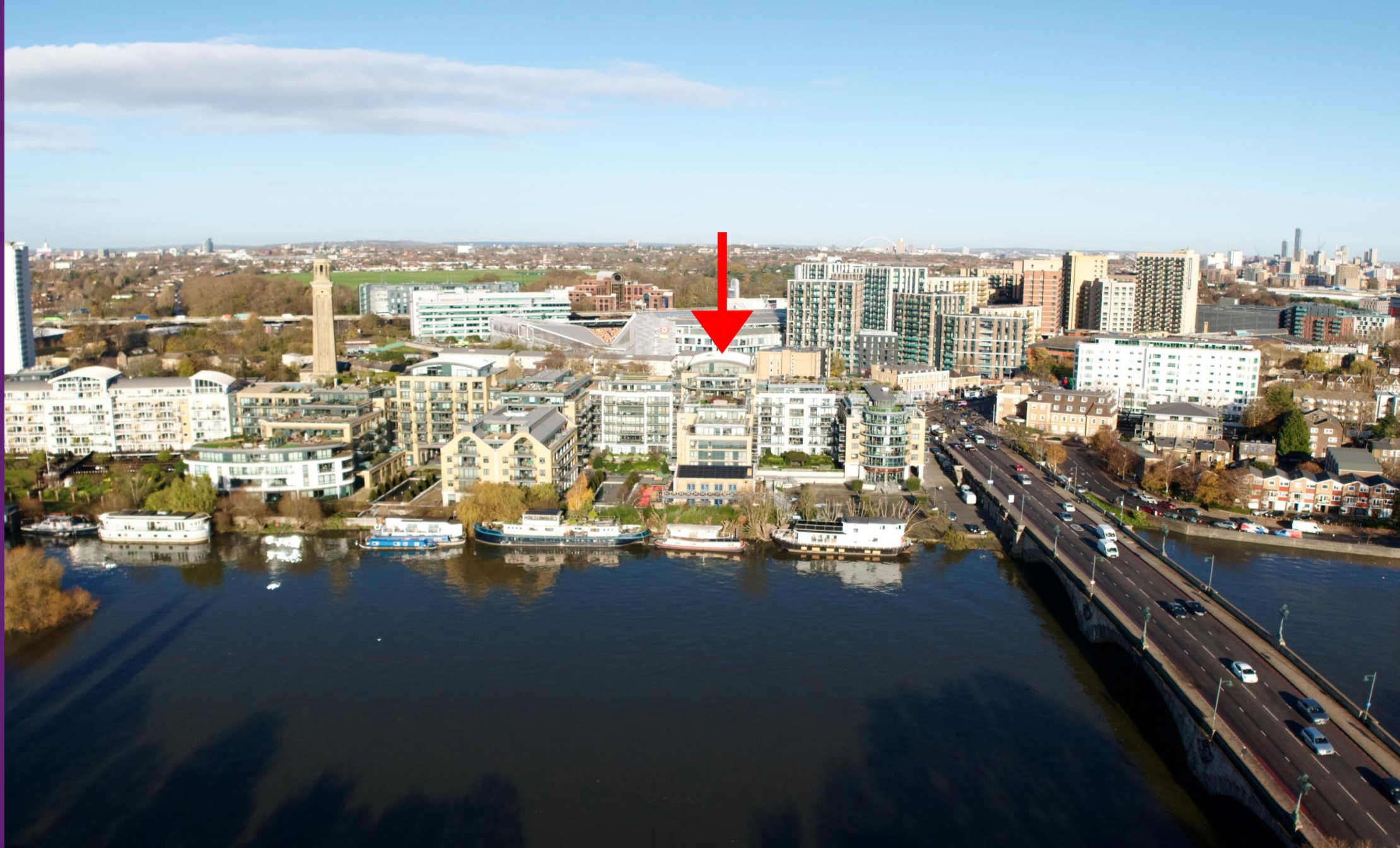
Belvedere House Kew Bridge, TW8