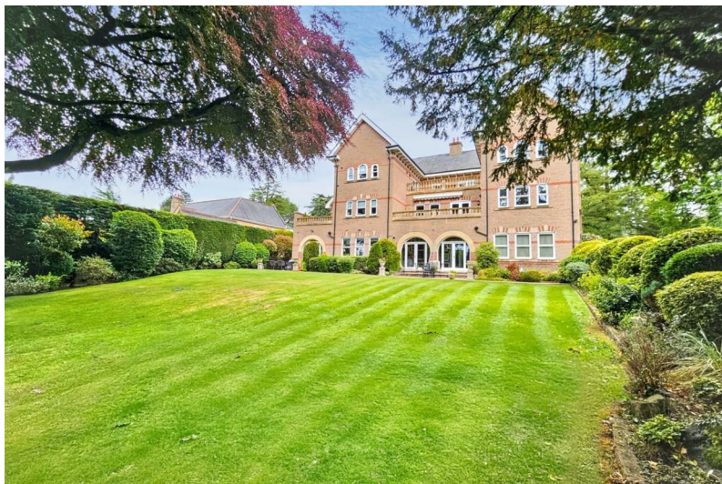
The Penthouse, Apt 5 Chenies Park Road, Bowdon, Altrincham, WA14 3JJ £10,000 PCM

A STUNNING LUXURY PENTHOUSE APARTMENT SPANNING APPROXIMATELY 3,700 sq ft WITH EXCELLENT TRANSPORT ROUTES NEARBY. Direct Lift Access. Hall. Family/Dining Room. Kitchen. Living Room. Utility Room. Cinema Room. Four Double Bedrooms. Four Bath/Shower Rooms. Two Secure Parking Spaces. Communal Hall. Extensive Communal Gardens. Council Tax Band H. Furnished OR Unfurnished, Landlord is Flexible. Available NOW.