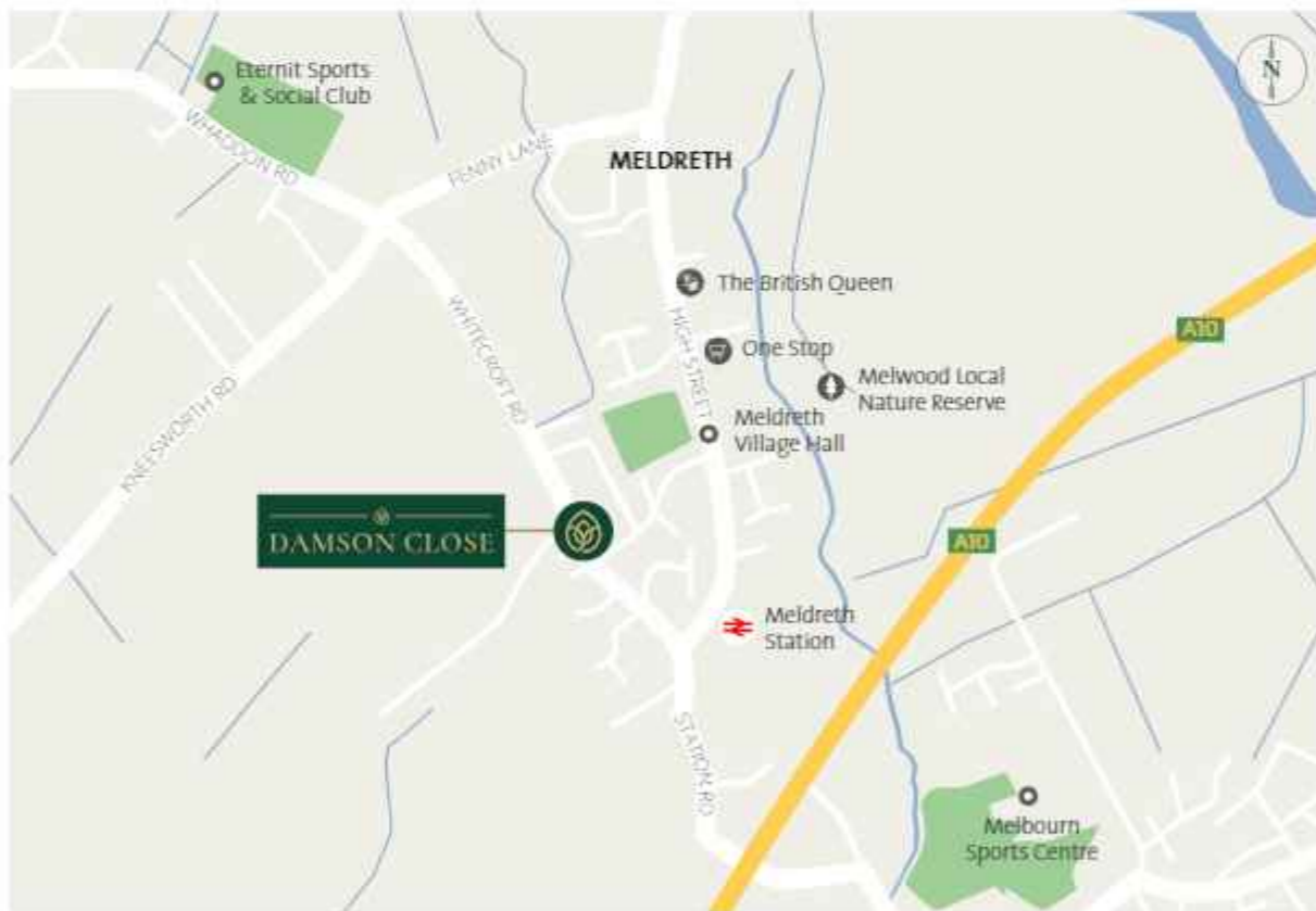
DAMSON CLOSE, WHITECROFT ROAD, MELDRETH, ROYSTON SG8 6GS

It is not possible in a brochure of this nature to do more than give a general impression of the range, quality and variety of the homes we have on offer. The computer generated imagery, floor plans, configurations and layouts are included for guidance only. The properties may vary in terms of elevational design details, position/size of garage and materials used. Such changes are due to our commitment to creating homes of individual character, although similar to others. We operate a policy of continuous product development so there may be material differences between the accommodation depicted in our literature and that on offer on any particular development or different times during the progress of any development. Maps not to scale. Photographs are of the local area or are indicative lifestyle images. 06/23.