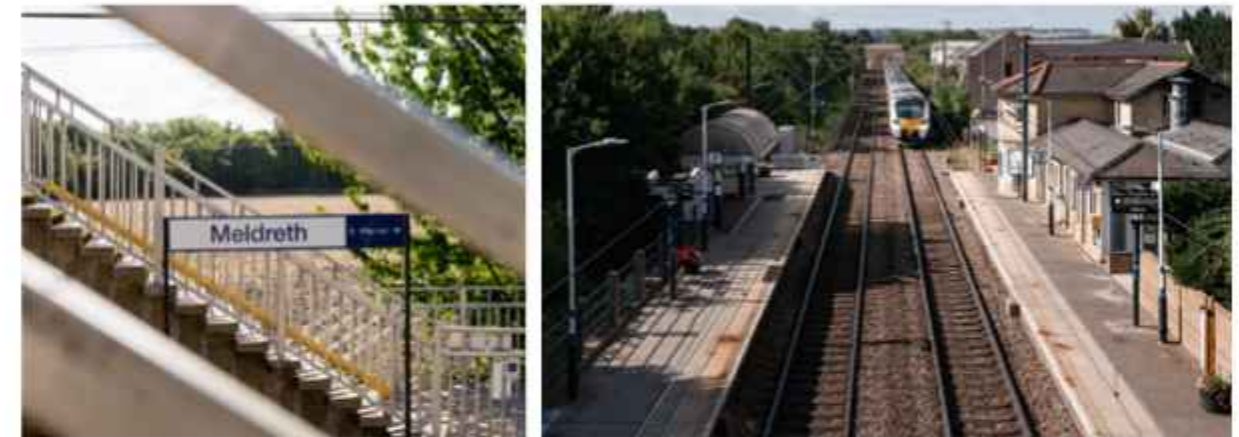
Damson Close is ideally located 0.2 miles from Meldreth train station.

The village benefits from its own highly regarded primary school, while nearby Melbourn Village College caters for 11–16-year-olds. Royston boasts a choice of primary schools, along with an academy and sixth form college. Cambridge is also easily accessible, with a number of well-regarded independent schools including Abbey College, King's College, The Leys and The Perse.