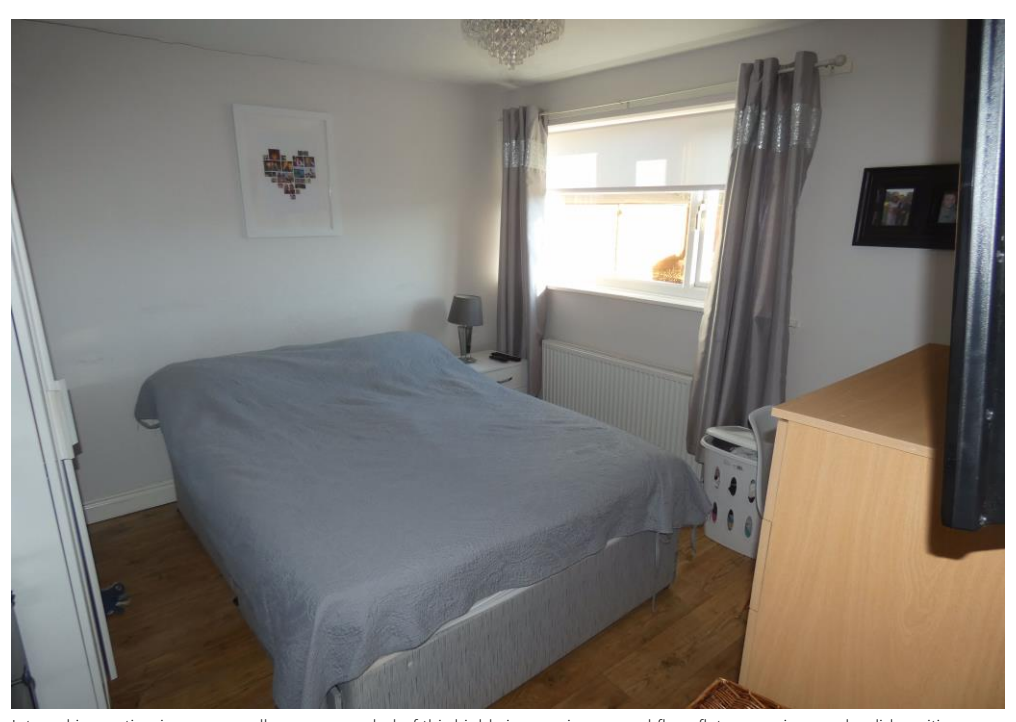
Internal inspection is unreservedly recommended of this highly impressive ground floor flat occupying a splendid position on the popular lakeshore development and close to extensive range of excellent local amenities. The property has been considerably improved by the present owner and briefly comprises an entrance porch, open plan living room/kitchen with a high quality kitchen area, an inner hall providing access to two bedrooms and a well fitted bathroom/wc.. Externally the property boats a large rear garden with a substantial timber shed and a single garage located in a rear block. There is gas fitted radiator central heating, UPVC double glazing, a high standard of decoration and fittings generally throughout and it should appeal to a wide range of prospective buyers.