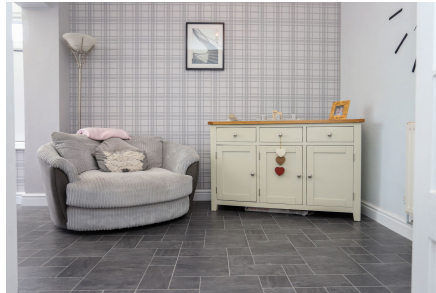
Please quote ref AT0132 A stunning, extended three bedroom semi tucked away in a quiet cul de sac in Hurst Green.