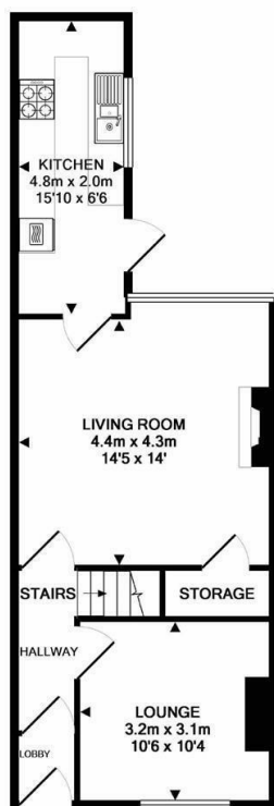
GROUND FLOOR APPROX. FLOOR AREA 45.5 SQ.M. (490 SQ.FT.)

The property benefits from the modern day comforts of light oak double glazing and gas fired central heating and an internal viewing appointment is recommended.