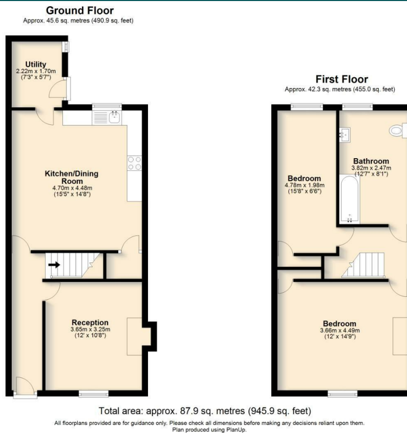
Godley Street, Burnley

Viewings are conducted by Petty Real – contact us today to book your appointment and avoid missing out on this fantastic opportunity!