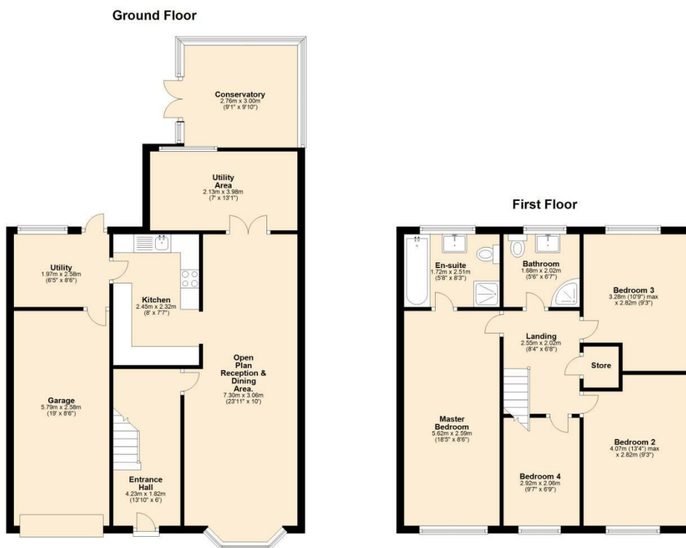
All floorplans provided by Petty Real are for guidance only. Please check all dimensions before making any decisions reliant upon them. Plan produced using PlanUp.

The front of the property has been thoughtfully transformed into a multi-car driveway, ensuring plenty of parking space.